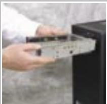
DE100 receiving frame in any standard 5.25" bay