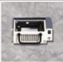
Available in PC White and Black