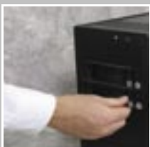
The DE100 also accommodates undersized or custom bays