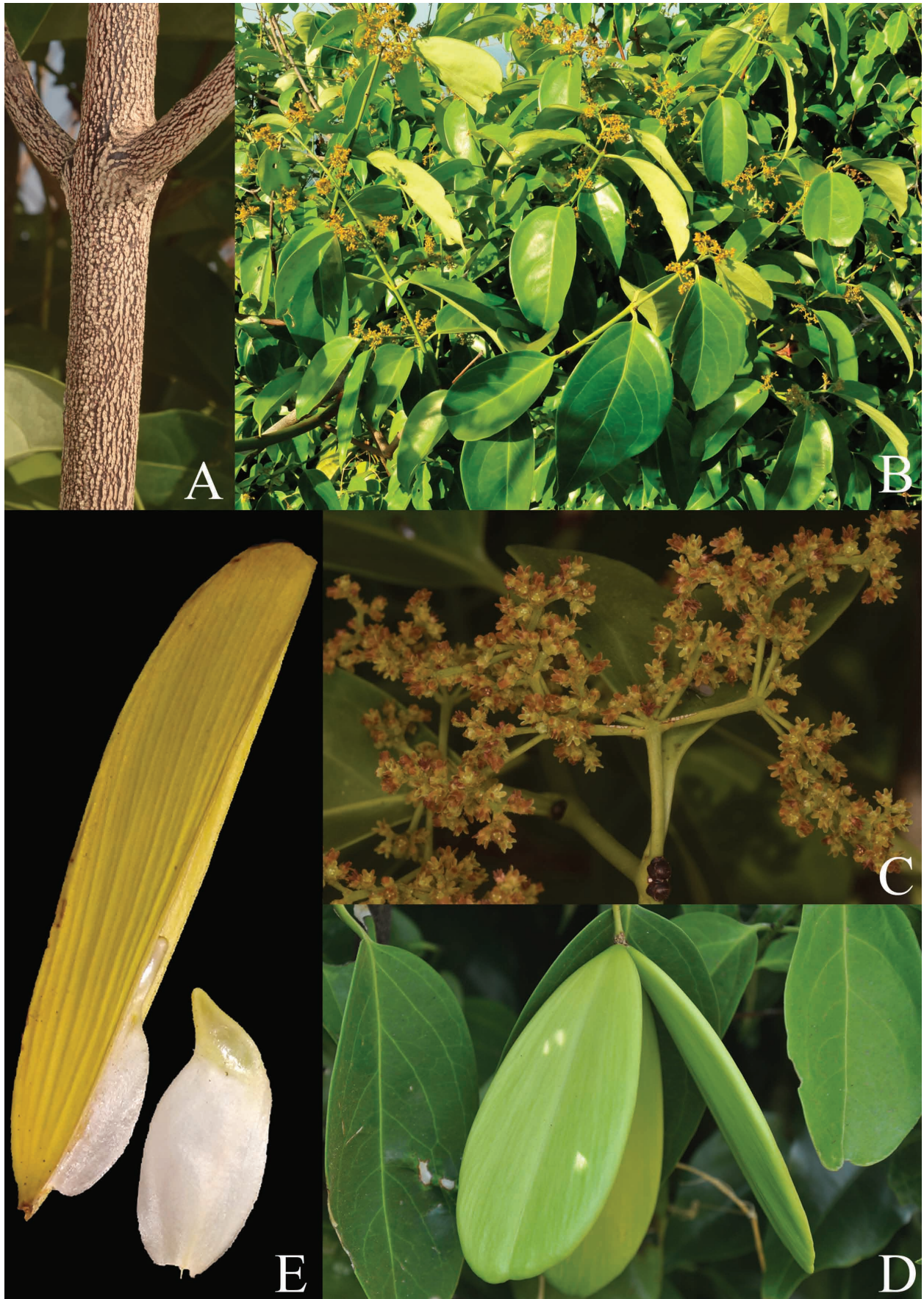
FIGURE 2. Reissantia sessiliflora A. Stem showing reticulation. B. Flowering twigs. C. Inflorescence showing sessile flowers. D. Fruit. E. Torn capsule showing seeds.