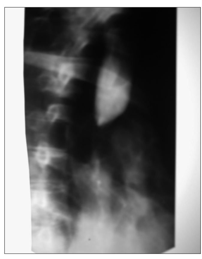
Fig.1. X-ray examination of the upper part of GIT

alkaline solution) by mistake, as a result of which she underwent symptomatic infusion therapy at regional hospital. Gradually, the dysphagia progressed, in connection with which the patient was transferred to the SI «Zaycev V.T. IGUS NAMSU». At the time of the first admission to our hospital the patient was in very severe general condition. The patient complained of inability of liquid drinking, weight loss, weakness, dizziness. The patient's weight was 38 kg. The body mass index (BMI) was 16.9 kg/m2 [15, 16]. Nutritional status was very poor. The patient was exhausted. There was not observed any comorbidity in such case.