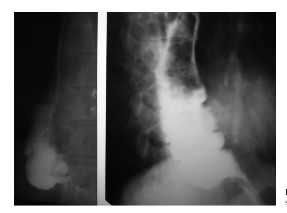
Fig.3. X-ray examination of the esophagocoloplasty segment