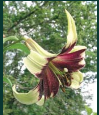
448. Lilium nepalense