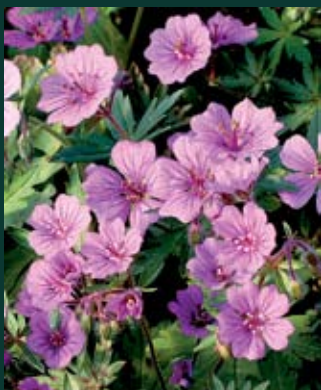
385. Geranium charlesii punctata