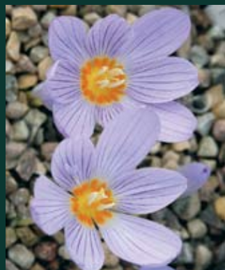
224. Crocus kotschyanus HKEP-9205