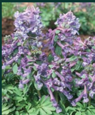
187. Corydalis subremota