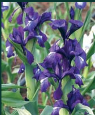
403. Iris aucheri Indigo King