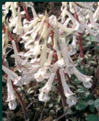
191. Corydalis glaucescens