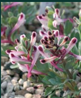
190. Corydalis erdelii