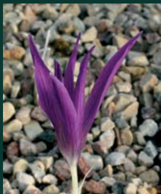
216. Crocus dispathaceus