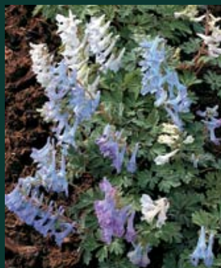
186. Corydalis ornata