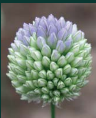
31. Allium scabriflorum