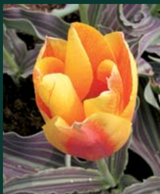
555. Tulipa vvedenskyi x Amberland