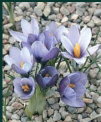
289. Crocus michelsonii