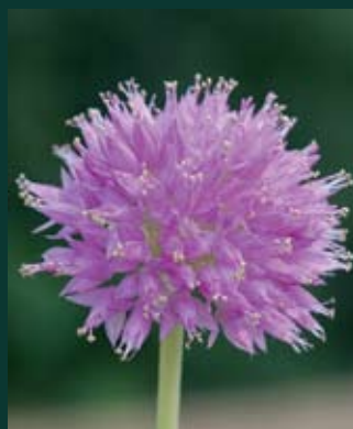
60. Allium sanbornii congdonii