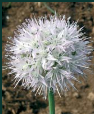
48. Allium douglasii nevii