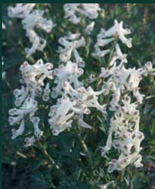
185. Corydalis magadanica