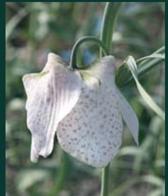
381. Fritillaria tortifolia