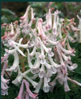
138. Corydalis kusnetzovii