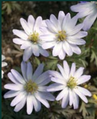
84. Anemone blanda Akseki