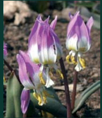
327. Erythronium sibiricum Grandiflora