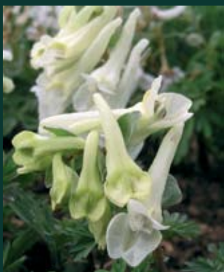
142. Corydalis vittae