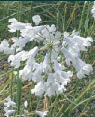
72. Triteleia grandiflora howellii