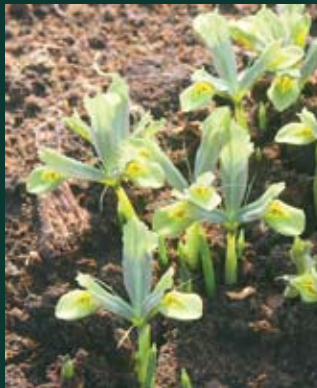
442. Iris x Sea Green