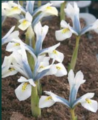
436. Iris x Making Out