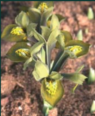
439. Iris x Passion