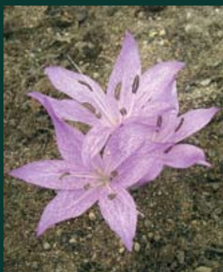
123. Colchicum macrophyllum