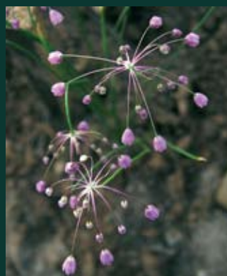
35. Allium tchihatschewii