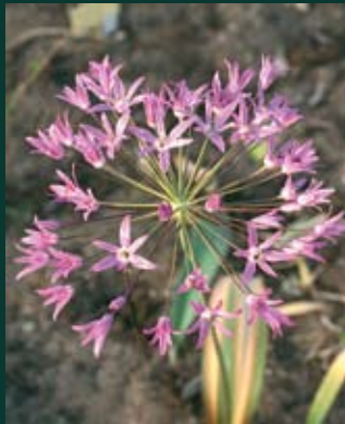
9. Allium cupuliferum