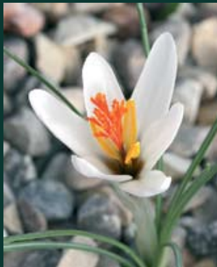
277. Crocus fleischeri