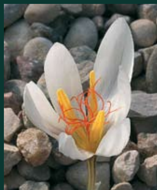
229. Crocus lycius