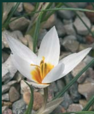
305. Crocus stridii