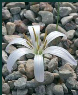
120. Colchicum jolantae