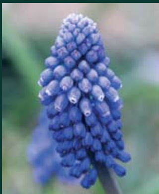
468. Muscari sp. Vaclav