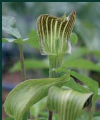
109. Arisaema triphyllum