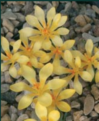
276. Crocus danfordiae