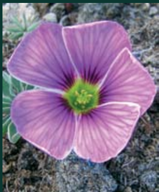
489. Oxalis enneaphylla Anette