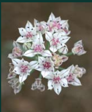
55. Allium lacunosum davisiae