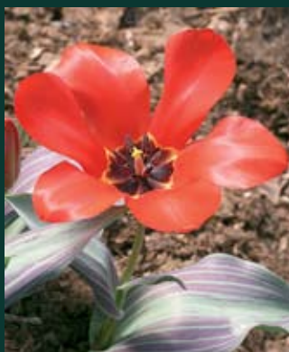
565. Tulipa vvedenskyi x Glazed Star