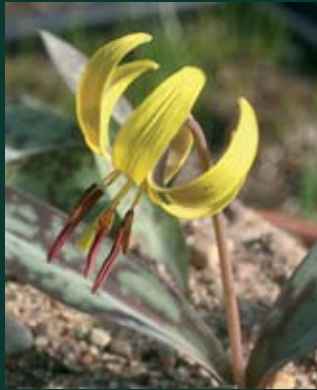
317. Erythronium americanum