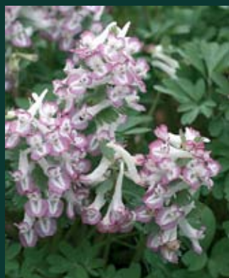
154. Corydalis solida 'Frodo'