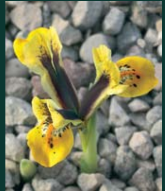
437. Iris x Orange Glow