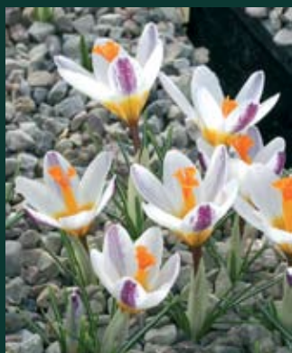
303. Crocus sieberi