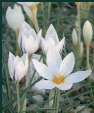
227. Crocus laevigatus