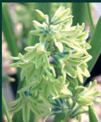
493. Puschkinia peshmenii