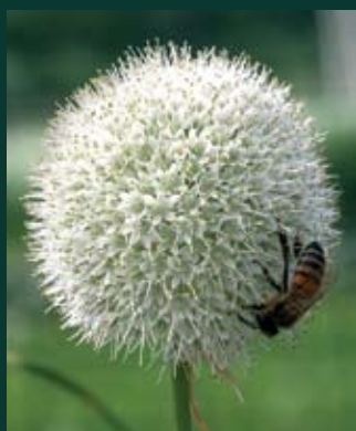
22. Allium myrianthum