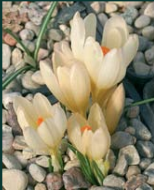
271. Crocus cvjicii 'Cream of Creams'