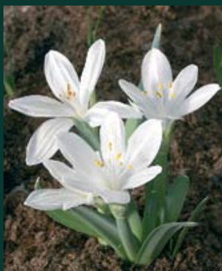
505. Sternbergia candida