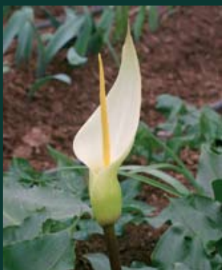
112. Arum creticum Stevens' form