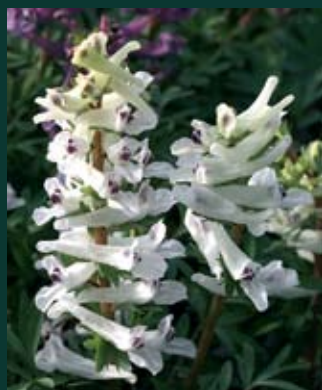
143. Corydalis wendelboi