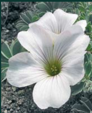
491. Oxalis enneaphylla White Cloud