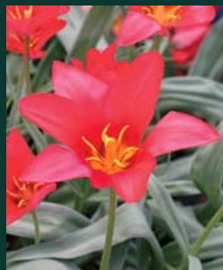
573. Tulipa vvedenskyi x Pretty Paula