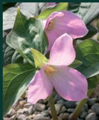
509. Trillium grandiflorum Gothenburg's Pink