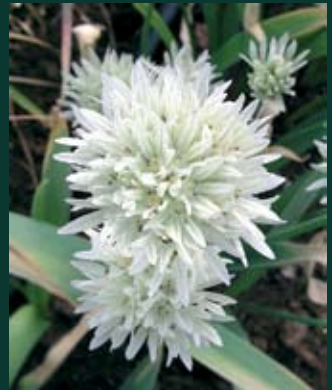
10. Allium darwasicum