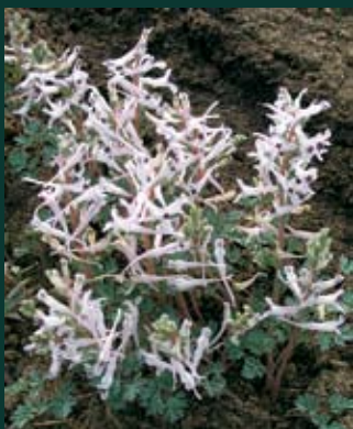
137. Corydalis henrikii