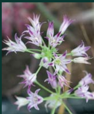
40. Allium bisceptrum