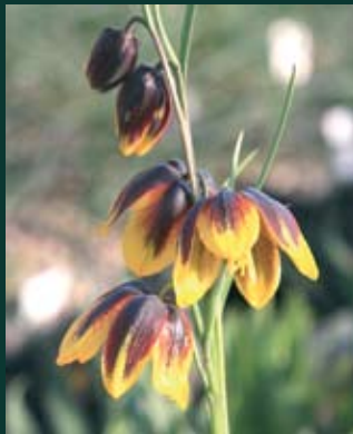
373. Fritillaria reuteri