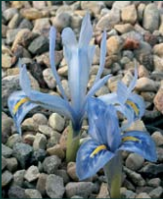
422. Iris histrio aintabensis