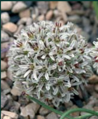
12. Allium egorovae