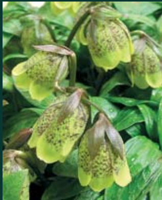
342. Fritillaria davidii