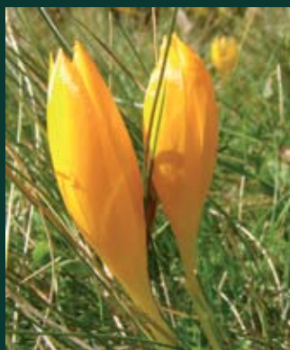
242. Crocus scharojanii