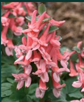
152. Corydalis solida 'Falls of Nimrodel'