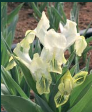
401. Iris x albomarginata Moonlight