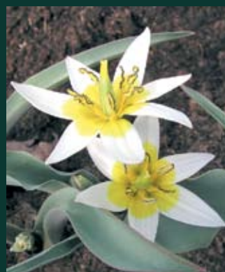
544. Tulipa orithyioides