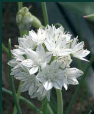
52. Allium haematochiton