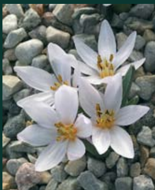
129. Colchicum serpentinum