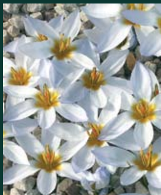
287. Crocus leichtlinii