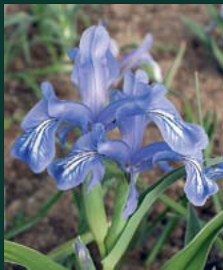
419. Iris zenaidae