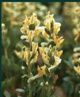
194. Corydalis maracandica