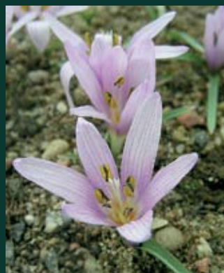
125. Colchicum munzurense