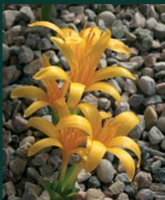
122. Colchicum luteum