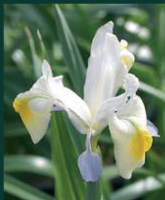
405. Iris x Cool Elegance