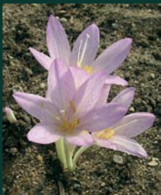
118. Colchicum davisii