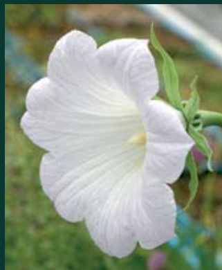
486. Ostrowskia magnifica