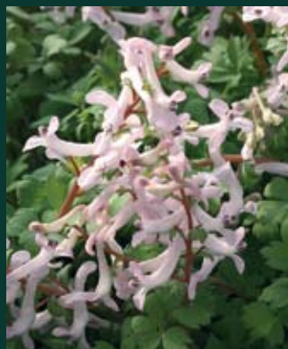
140. Corydalis paschei