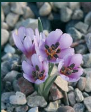
119. Colchicum hirsutum