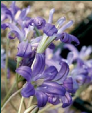
69. Brodiaea terrestris