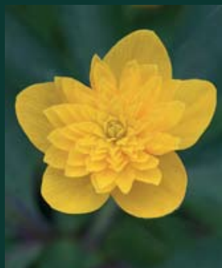
102. Anemone ranunculoides Kai