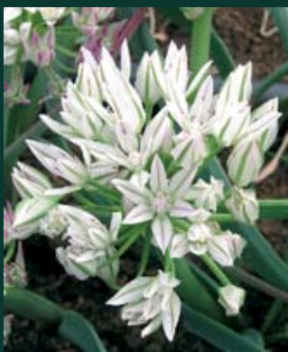
43. Allium crenulatum