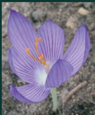
204. Crocus autranii