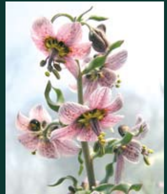
345. Fritillaria gibbosa