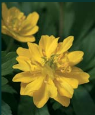
104. Anemone ranunculoides Kidspee