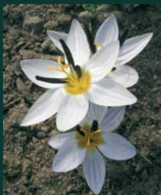
291. Crocus nubigena