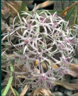
5. Allium austroiranicum