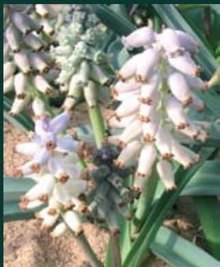
465. Muscari muscarimi Honaz-Dag