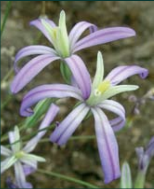
68. Brodiaea purdyi