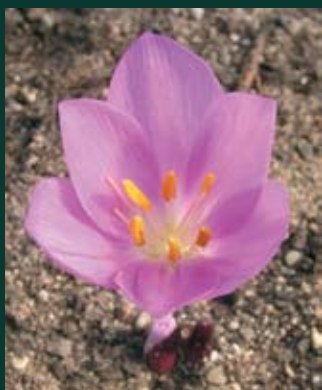
128. Colchicum sanguicolle