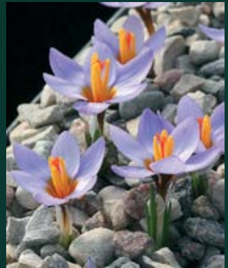
272. Crocus cyprius