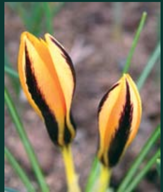
279. Crocus graveolens