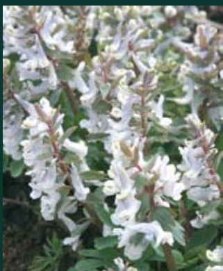
149. Corydalis solida 'Crispy Love'