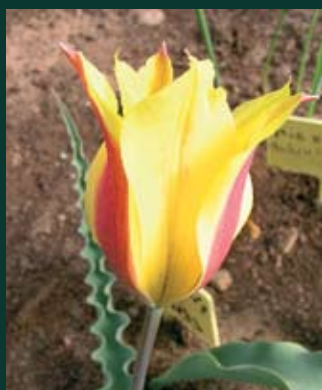
525. Tulipa ferganica