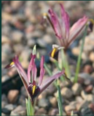
425. Iris kurdica