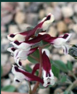
195. Corydalis naryniana