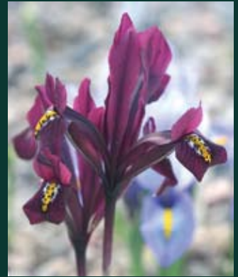
428. Iris reticulata kopetdaghensis