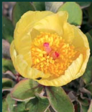
492. Paeonia sp. nova Iran