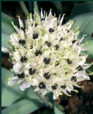
19. Allium kharputense