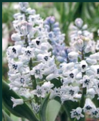
395. Hyacinthella campanullata