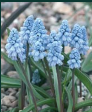
459. Muscari coeleste