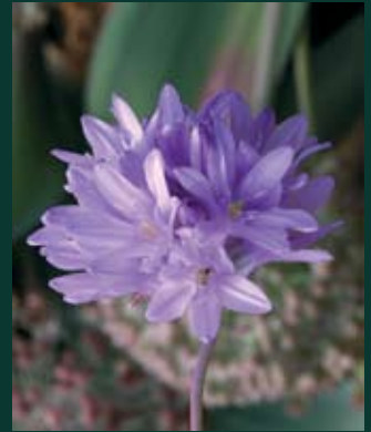
71. Dichelostemma congestum