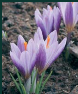
311. Crocus versicolor