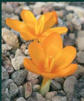
280. Crocus herbertii