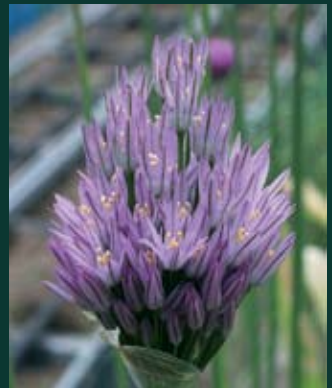
20. Allium lipskyanum