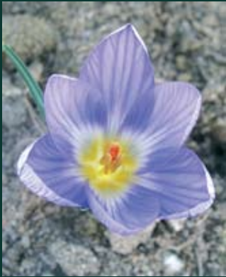
254. Crocus aerius