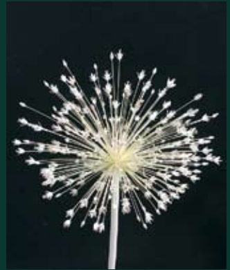
6. Allium baisunense