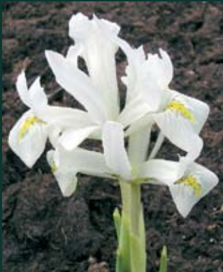
432. Iris winogradowii Alba