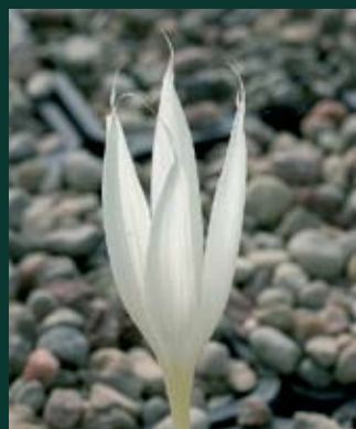
249. Crocus vallicola