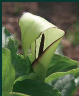
113. Arum hygrophillum