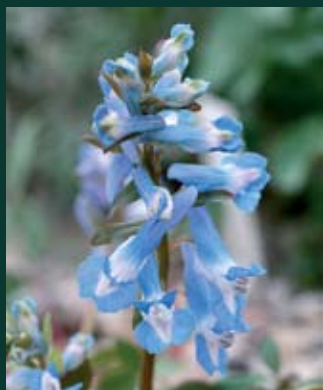
183. Corydalis fumariifolia