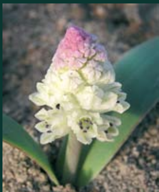
449. Bellevalia crassa