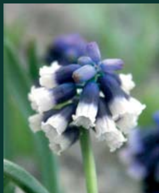
461. Muscari discolor