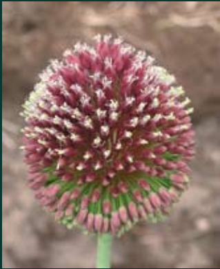
4. Allium amethystinum