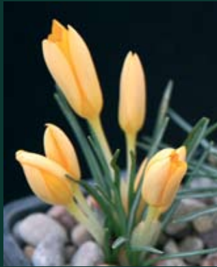
259. Crocus angustifolius 'Berlin Gold'