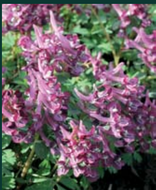
141. Corydalis pumila