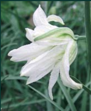
359. Fritillaria meleagris Alba Plena