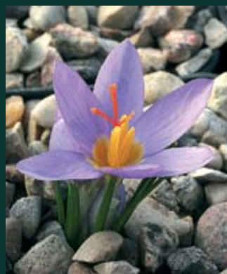
293. Crocus paschei