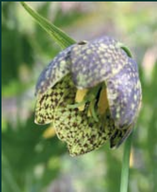
341. Fritillaria dagana