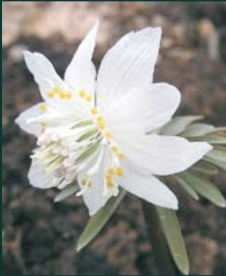
316. Eranthis stellata