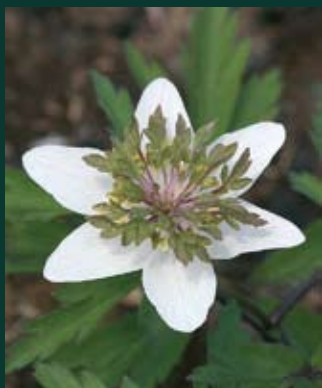
93. Anemone nemorosa Green Fingers