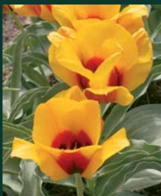
531. Tulipa greigii x Goldmine