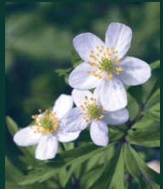
86. Anemone coerulea