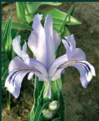
417. Iris willmottiana