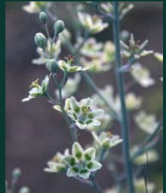
78. Zygadenus elegans