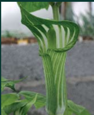
108. Arisaema robustum