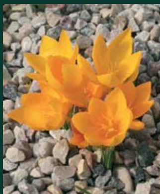
292. Crocus olivieri