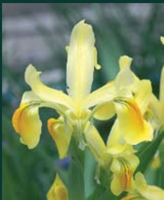
414. Iris x Sunny Side