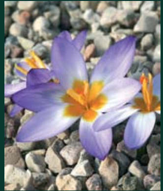
261. Crocus atospermus