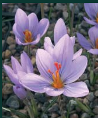
228. Crocus longiflorus