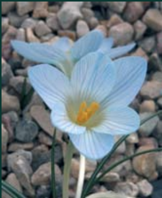
264. Crocus baytopiorum