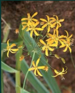
73. Triteleia hendersonii