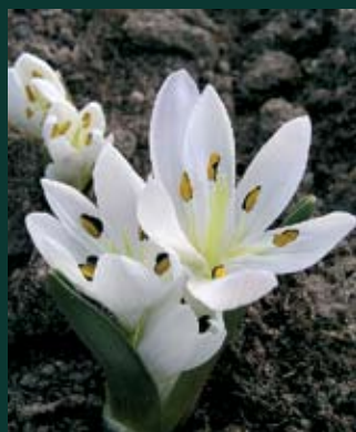
131. Colchicum trigynum