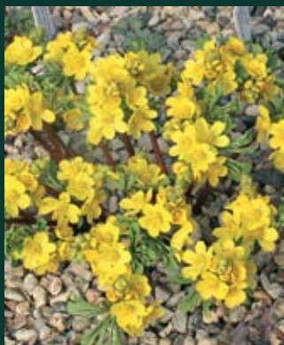
392. Gymnospermium altaicum