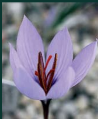
237. Crocus pallasii Chios