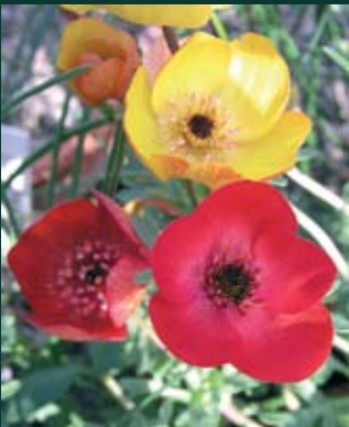
83. Anemone biflora