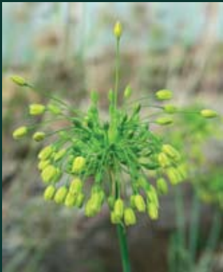
8. Allium chloranthum