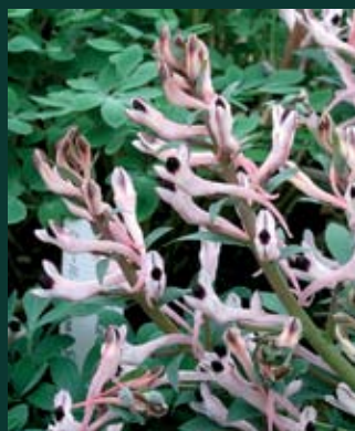
199. Corydalis schanginii