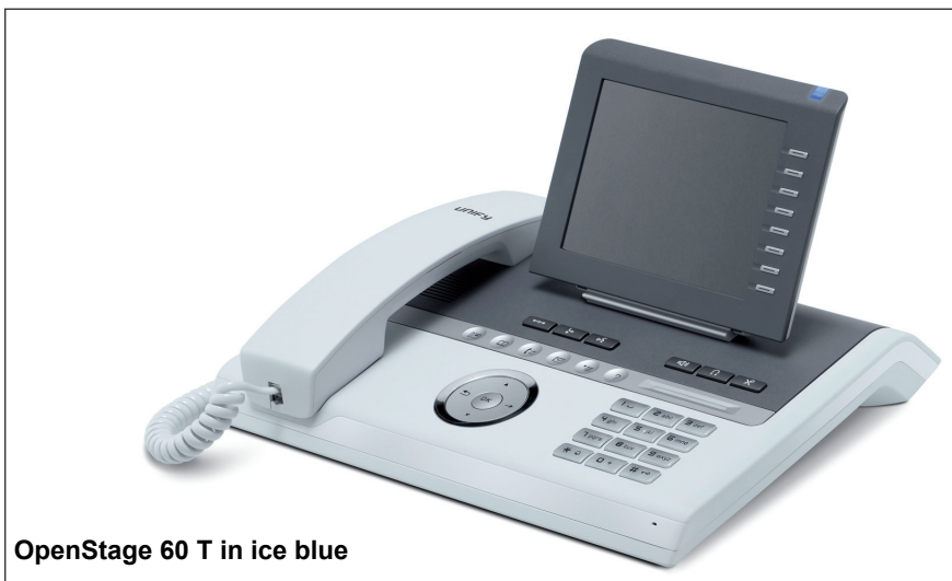
OpenStage 60 T in ice blue

OpenStage 10 T, 15 T and 30 T are downwards compatible and can be operated like optiPoint phones.