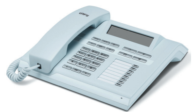
OpenStage 30 T