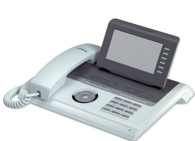
OpenStage 40 T