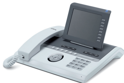
OpenStage 60 T