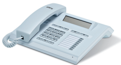
OpenStage 15 T