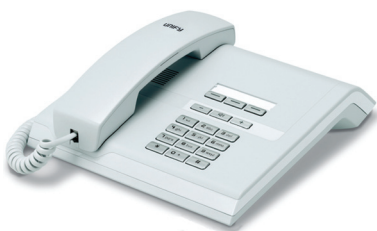
OpenStage 10 T