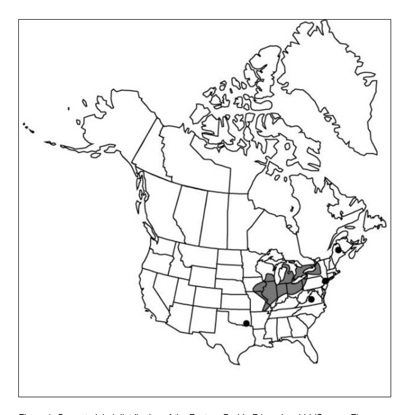
Figure 1. Current global distribution of the Eastern Prairie Fringed-orchid

Virginia and north to Ontario. A disjunct population occurs in Maine (COSEWIC 2003, U.S. Fish and Wildlife Service 1999).