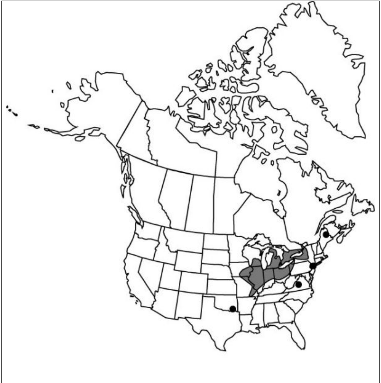
Figure 1. Current global distribution of the Eastern Prairie Fringed-orchid

Virginia and north to Ontario. A disjunct population occurs in Maine (COSEWIC 2003, U.S. Fish and Wildlife Service 1999).