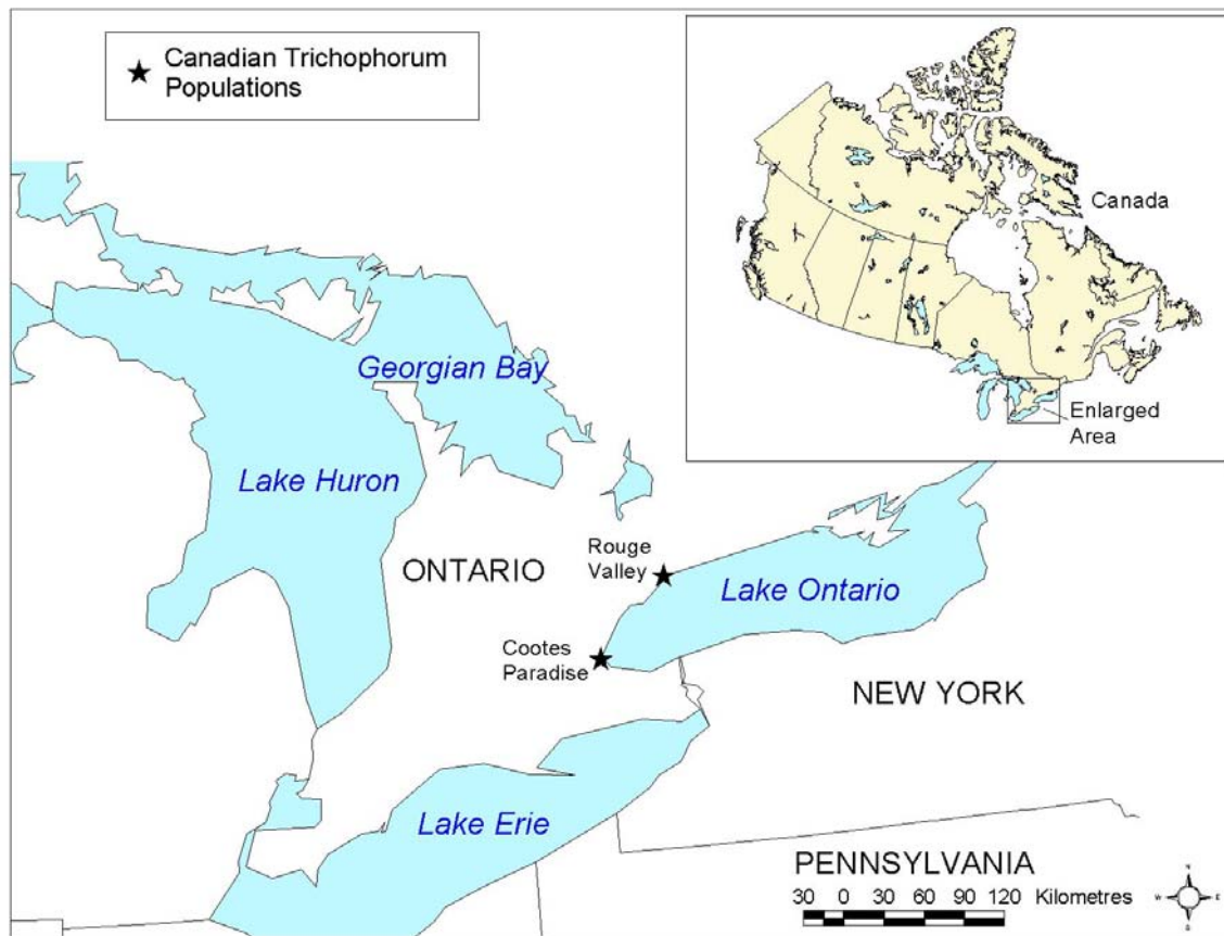
Figure 2. Canadian Distribution of Few-flowered Club-rush/Bashful Bulrush