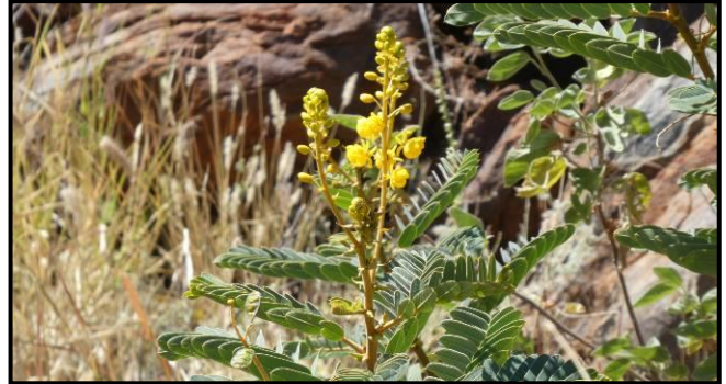
Land for Wildlife