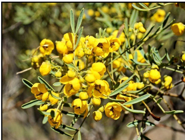
Senna artemisioides subsp. alicia