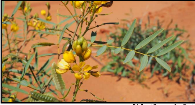
SA Seed Conservation Centre