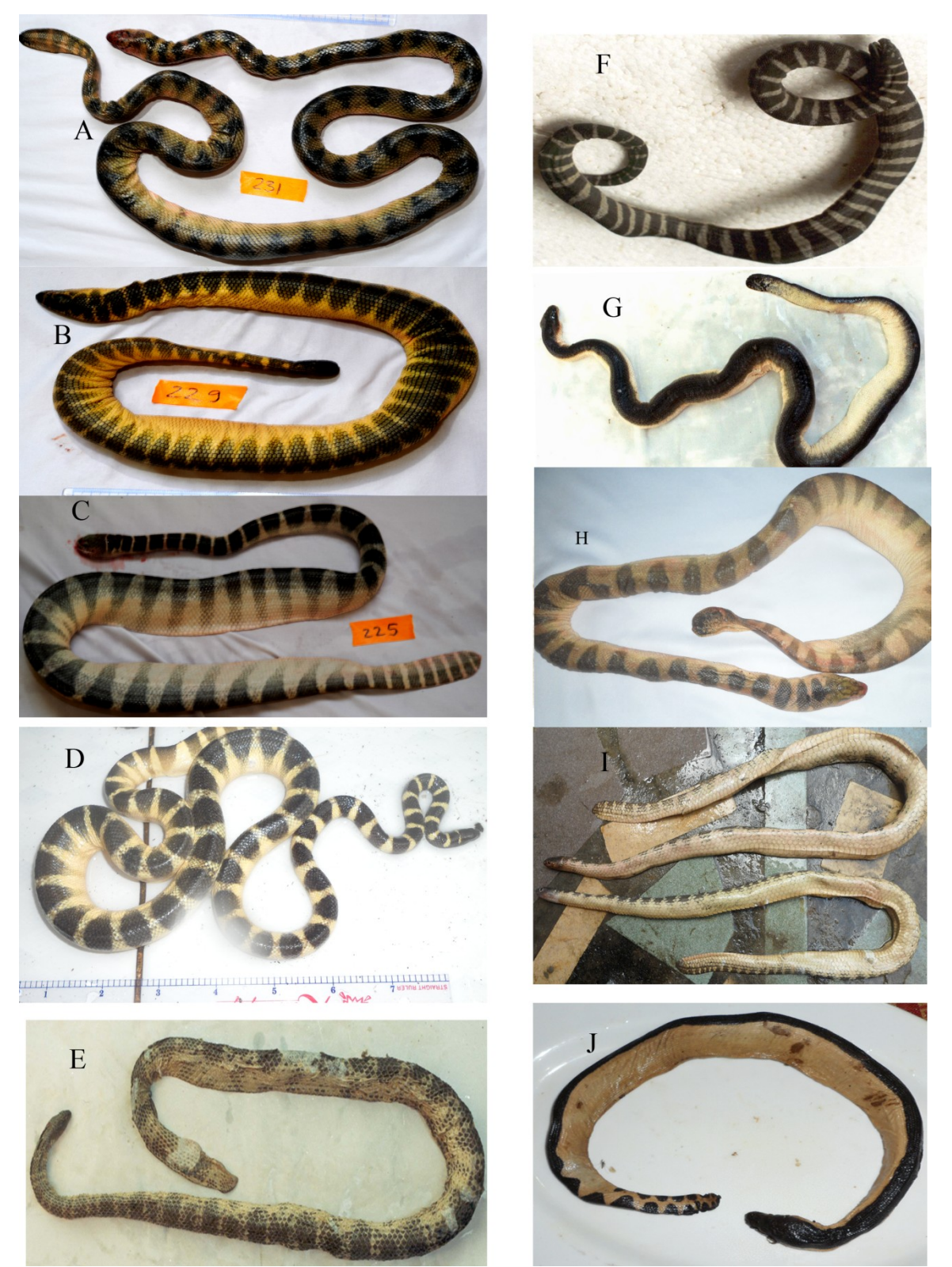
Figure 2. Sea snake species recorded in Song Doc and Vung Tau. A, Hydrophis cyanocinctus; B, Hydrophis (Lepamis) curtus; C, Hydrophis ornatus; D, H. fasciatus; E, Acalyptophis peronii; F, Acrochordus granulatus; G, Thalassophina viperina; H, Hydrophis lamberti; I, Aipysurus eydouxii; J, Lepamis platurus