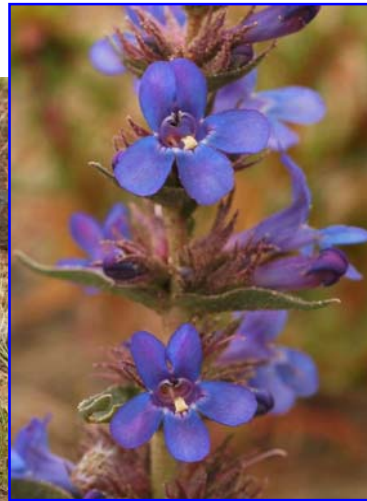
Coerulei group 6-24 " tall One to several erect

stems. Leaves are thick and leathery, 2-7 cm (3/4 -2 3/4 inches) long on stiff petioles. The inflorescence is a narrow, elongated and congested panicle. Flowers are sky blue to lavender, 1.2 – 2 cm (1/2 to 3/4 inch) long. There are 2 intergrading varieties, ours is acuminatus.