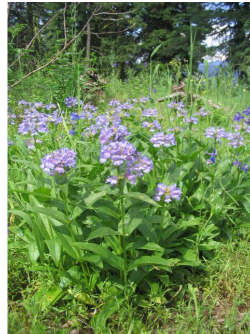
Proceri group 8 – 24 " tall Rosettes of bright green lvs with erect flower stems. Basal and stem leaves oval with pointed tip. Smaller leaves clasp stem. Flowers to 3/4 " long, bright blue to purple blue. In small clusters, or more often in one large globe at stem top.

Habitat Moist to vernal wet meadows at high elevation. Blooms in summer and fall.