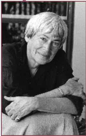
Author Le Guin has been a WILPF member since 1982.

Let them speak long together of justice and kneel down then to drink from the wells and springs that are life in that desert, praising the giver of the holy waters. And may this curse be upon you and your sons and your daughters to the ninth generation. ❖