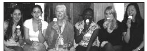
Taking an ice cream break at a Y-WILPF meeting.

Please select "Y-WILPF" from the drop-down options on the DIA web-