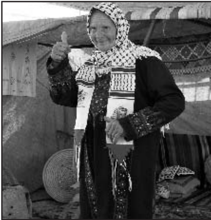
Gaza woman celebrating International Women's Day at the Malwasi Agricultural Region, Rafah.