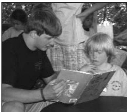
Volunteers are at the program's heart.

It is with intention that we choose to work peaceably and for peace in the world. The volunteers who organize the Jane Addams Peace Camp believe that the place to start is with children. We serve 60 children each summer, ages six to 17.