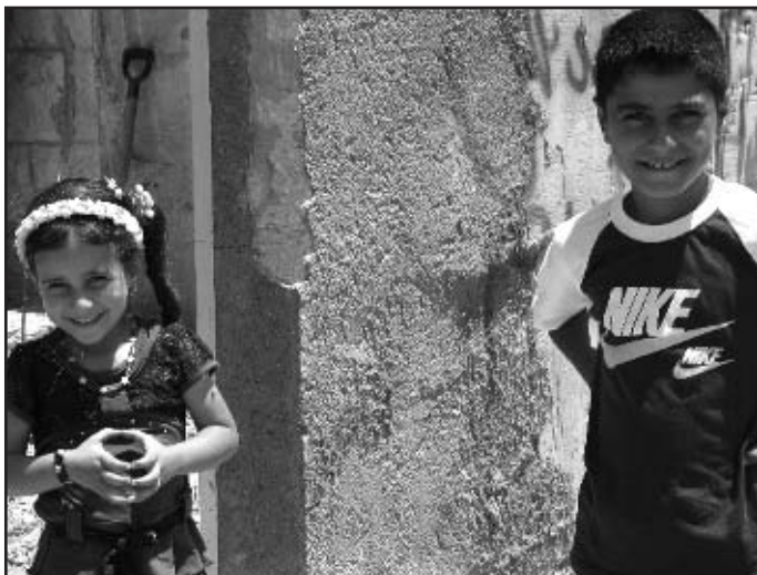
Children in Bil'in, a village in Gaza, where weekly demonstrations protest the occupation with signs such as those at left.

Gaza is like a prison, with air, land and water access blocked. It is a strip of land with the most densely populated communities in the world. Between Dec. 27, 2008 and