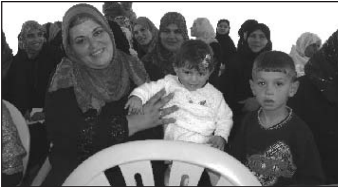
Women and children celebrate International Women's Day at the Malwasi Agricultural Region, Rafah.

There are now more than 120 Jewish settlements on Palestinian land officially recognized by Israel though considered illegal by international law. Between 80 and 100 more are dubbed “illegal” by Israeli officials. More than half a million Israelis now live in these settlements heavily subsidized by the Israeli government through funds from