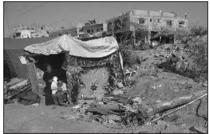
Above: Family with small child in makeshift hut in Gaza City residential area destroyed after 22 days of Israeli bombing.