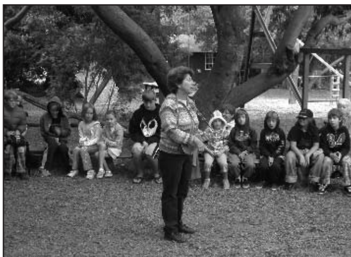
"Hearing Everyone's Voice" was this year's theme carried out through art, music, drama, games, stories and discussions.

with family members, friends and community. Young people replicate what they observe around them. Therefore, if they experience loving and respectful ways of being on this planet, peace will grow through the generations. The Jane Addams Peace Camp provides opportunities for young people to develop skills in peace making, creative problem solving, ecology and most of all making friends and having fun.