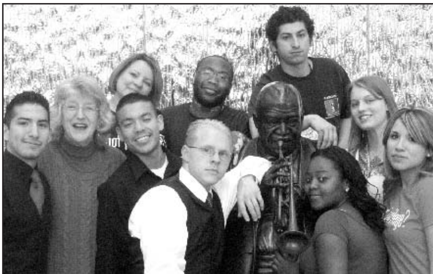
The author, second from left, in Memphis with the nine Santa Fe Community College students.