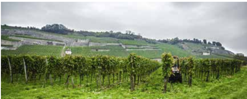
Kaiserstuhl Touristik Ihringen am Kaiserstuhl, Bachenstraße 38 Tel. +49 (0)7668 93 43 www.ihringen.de

Between the steep terraced vineyards, a lingering Mediterranean climate produces citrus fruits, almond trees, orchids and even wild cacti. Bright emerald lizards, praying mantises and other rare wildlife can often be caught sunning themselves on the warm rock walls. The Vulkanfelsgarten, or Volcanic Rock Garden, takes a circuitous, 2.4 km (1.5 mile) route around the Winklerberg, with stunning views over the Black Forest, Vosges Mountains and Swiss Jura.