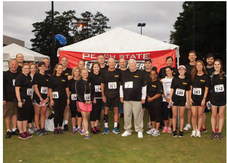
Peach State Freightliner Trucks at the 2014 Winship Win the Fight 5K.