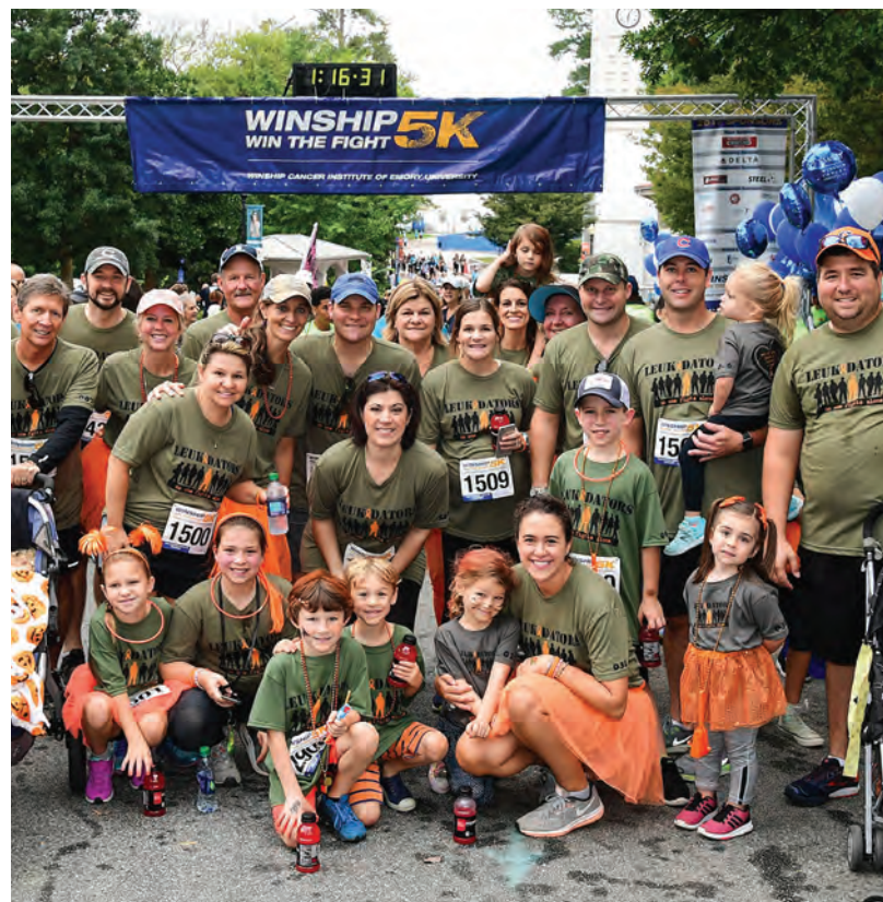
Above and below: The Leukidators Team at the 2017 Winship 5K

For more information about participating in the 2018 Winship 5K or to join the Leukidators, visit winship5k.emory.edu or http://bit.ly/Leukidators .