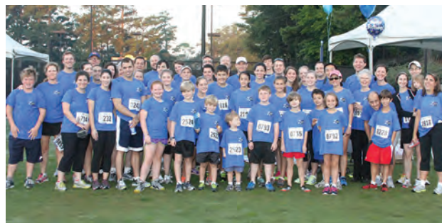
Some of the over 100 members of Jabian's 5K team, the Cancer Crushers, pose at last year's walk/run.