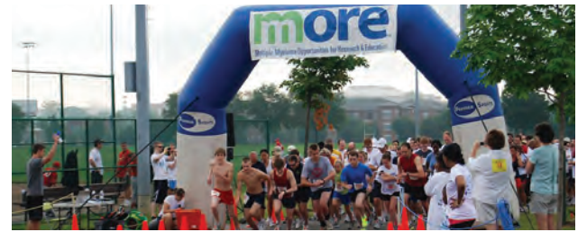
MMORE hosts events to raise funds for multiple myeloma research.