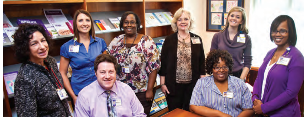
Pictured are staff members from Winship's Patient and Family Services; The Katz Foundation generously supports the Patient and Family Services Fund in addition to other areas at Winship.