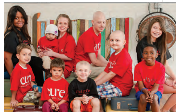
Current patients and survivors, some of whom are pictured here, benefit from CURE's investment in childhood cancer research. Since 1996, CURE has provided over $12 million for cancer research at Emory.