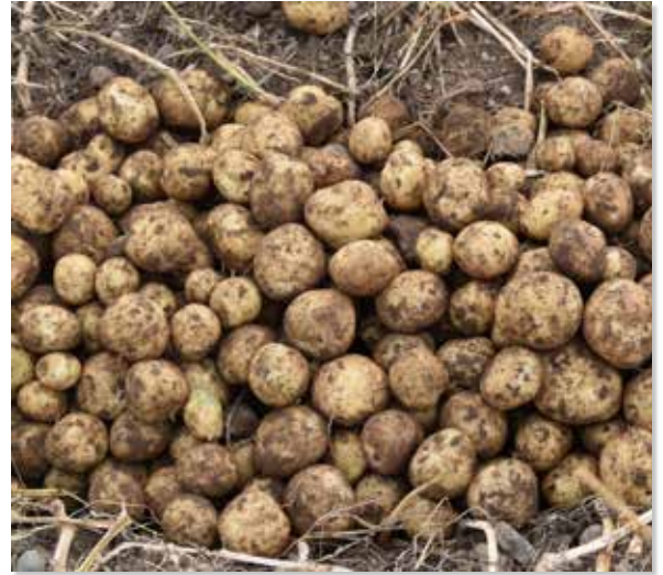
Size was consistent, yield good and the potatoes looked great going into storage on the last day of harvest, October 10, 2019, at Guenther Potato Company.

How's the year shaping up? Well, we had a cold, wet spring that pushed planting back, a cool summer and so far, a wet fall. With that said, our crop looks good for the growing season that we were dealt.