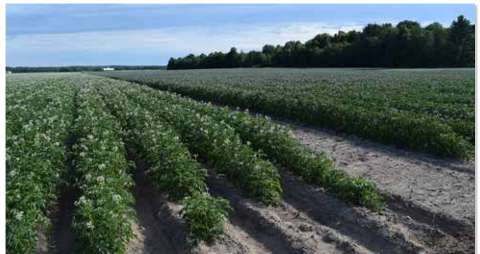
Above: Two healthy seed potato varieties are shown side-by-side and flowering beautifully on Guenther Potato Company land in 2018.