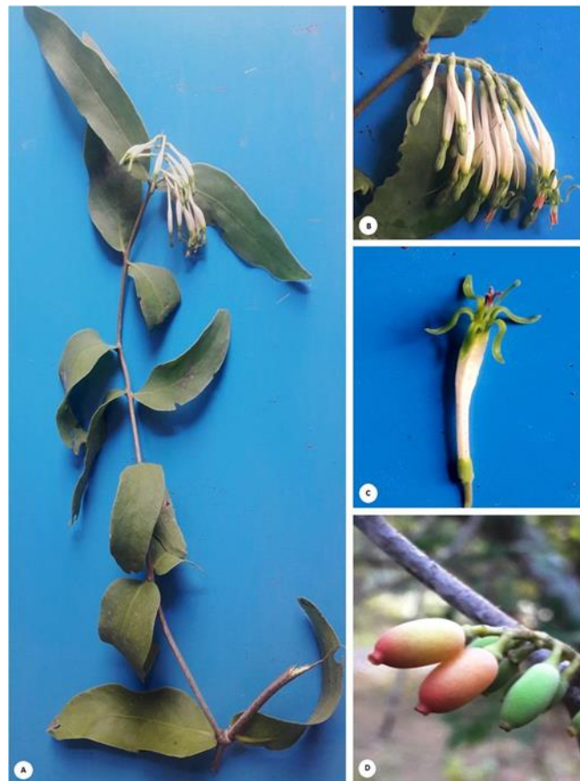
Figure 2 Morphological characteristics of Dendrophthoe falcata (L.f.) Etting.

(A) – Dendrophthoe var. falcata . (B) – Dendrophthoe var. coccinea