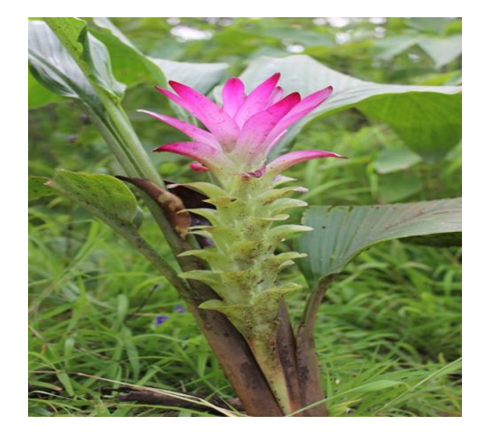
Fig.1: Habit of Curcuma pseudomontana Fig.2: Rhizome of Curcuma pseudomontana

In present investigation we have generated ribulose-15-bisphosphate carboxylase large subunit (rbcl) sequence for Curcuma pseudomontana. Its molecular phylogenetic relationships with other species are also studied. This can help in authentication of plant species for use in medical formulations in therapeutic uses.