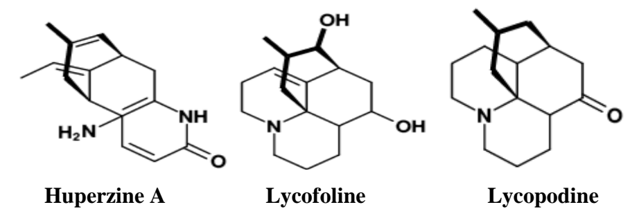
Figure 3: shows the important phytochemical constituents structures obtained from Lycopodium clavatum .

Parts used: Spores are crushed and mother tincture is obtained.