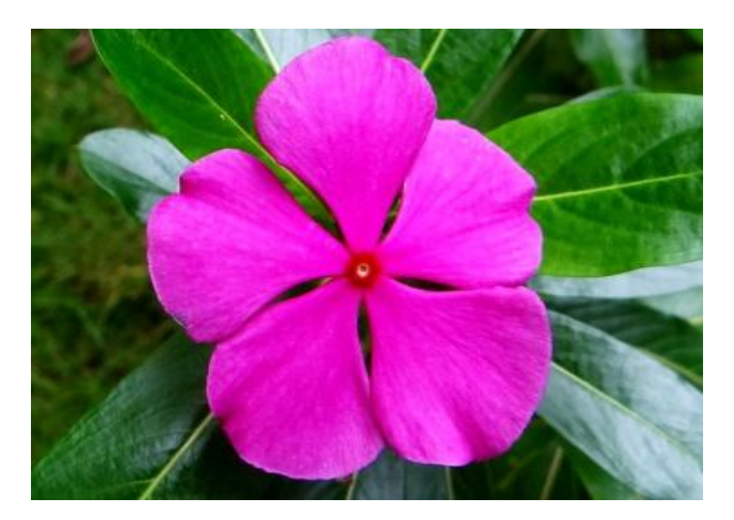
Cathranthus roseus flower.

It grows in semi-shade (light woodland) or non-shade up to 39 inches 1 m throughout all the season that's why is known as "Sadhaphuli" in Marathi. It has a well-drained soil, warm temperature (20-30°C) and full sun is required if the temperature will be below the 5°C whole plant die. It blooms throughout the year in tropical condition pollinated by butterflies and moths. It widely neutralized in subtropical, tropical areas around the world. [2,5]