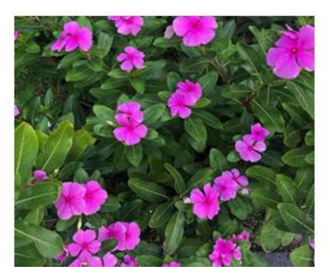
Catharanthus roseus growing plant.