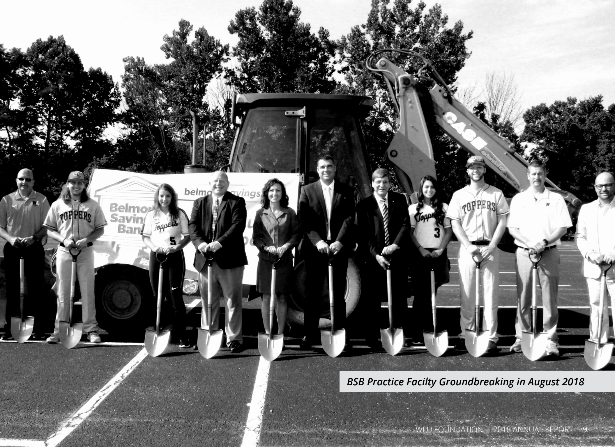
BSB Practice Facility Groundbreaking in August 2018