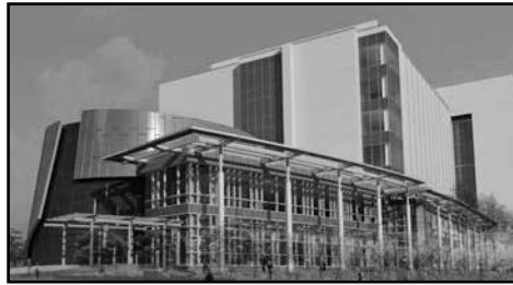
This artist rendering shows how the medical school building will look after renovations are completed.

A groundbreaking ceremony Oct. 12 launched a massive renovation of the downtown Kalamazoo building that will house the WMU School of Medicine and served as the forum for announcing that the school has been granted preliminary accreditation by the Liaison Committee on Medical Education, the national accrediting body for educational programs leading to the Doctor of Medicine degree.