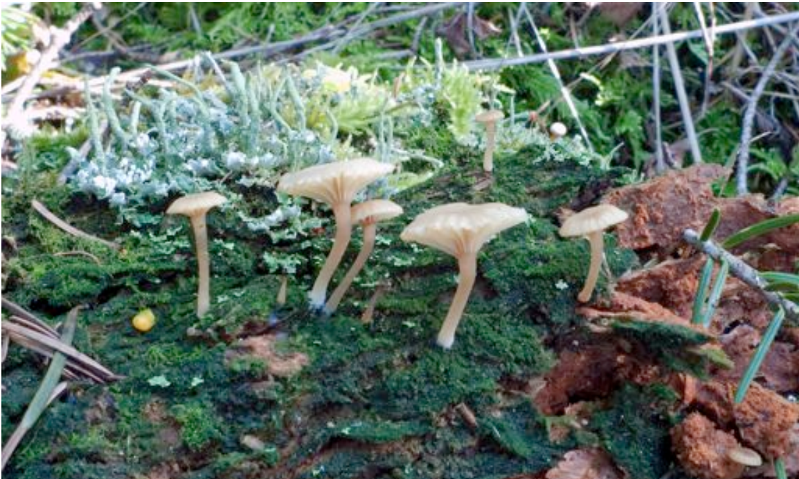
TABLE A – BAKER PRESERVE TRAIL

Lichenomphalia umbellifera . The fruiting bodies are mushrooms. The thallus is the dark green coating on the wood. It occurs on rotten logs.