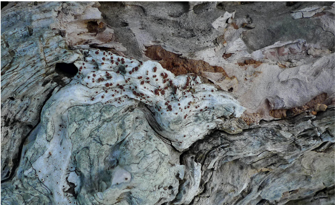
Lecanora xylophila and Lecanora orae-frigidae