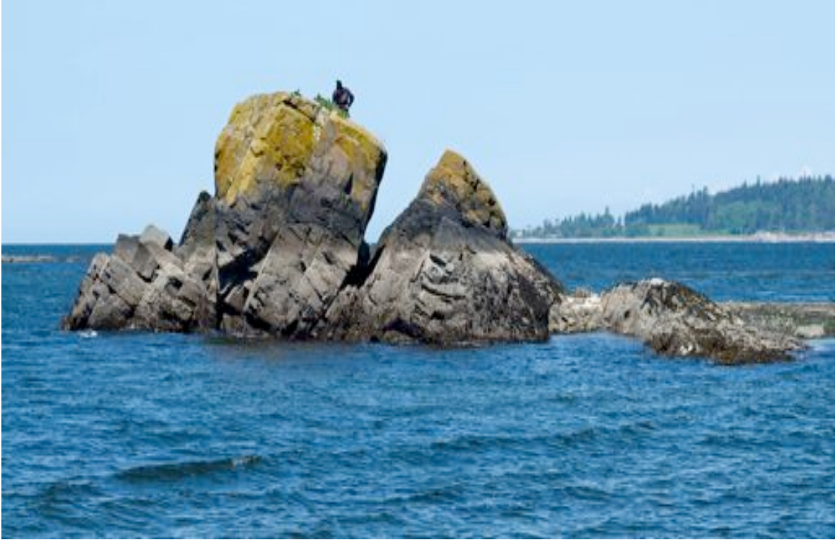
“Bird Rock” with distinct bands common to rocky Salish Sea shorelines. The black band consists of Verrucaria/Hydropunctaria , a smear lichen, and the yellow-orange is mainly Caloplacas and Xanthoria . (RD)

Since the slope along the west side of Lummi Mountain is prohibitively steep, the only (easy) access is via the Baker Ranch by way of a one mile trail/abandoned road to the shore. Most of the beach is rocky, stretching from the low tide mark to steep rock outcrops at the upper shoreline. Intertidal zones, spray zones, supratidal rocks, transitional woods, and driftwood combine to support a significant lichen population. Indeed, one reason for the Lummi collection is to integrate it with surveys conducted in the nearby San Juans such as Fidalgo, Cypress, Vendovi, and Lopez Islands. (See Lichens of South Lopez Island by Fred Rhoades, Washington Native Plant Society Occasional Paper 2009.) It is of interest to compare lichens found in the larger Salish Sea zone with those on Lummi. We found it noteworthy that a handful of species occur on Lummi that were not observed at the other sites. The shoreline we explored is just north of the Lummi Rocks, clearly visible off shore as seen in the following image.