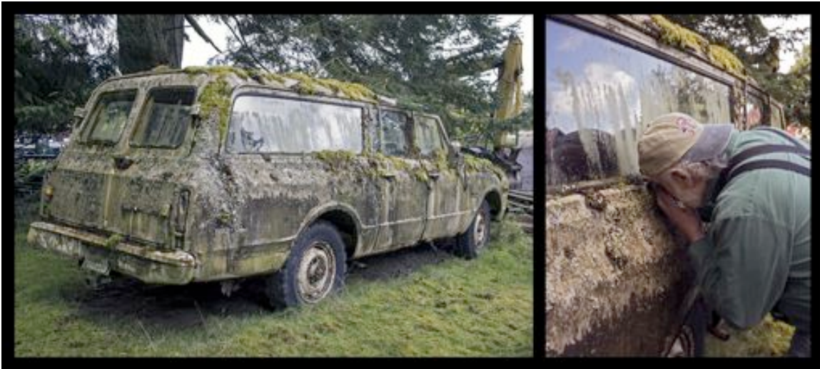
Vehicle at Baker Ranch colonized by lichens and moss (RD)

The two sites of this survey differ substantially as to habitat; consequently, the lichens collected at each are remarkably distinct (indeed with very little overlap). Thus, we attach a separate list for each location.