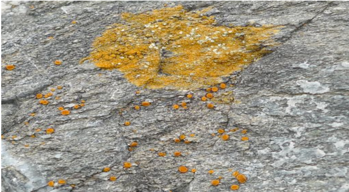
Caloplaca roseii and Caloplaca luteominia (Crustose) (WL)

(c) Crustose - Simple powder-like crusts, smears, or more elaborate structures firmly attached to the substrate (mainly rocks and trees). A few of the more common genera on Lummi include Amandinea , Buellia , Caloplaca , Graphis , Hydropunctaria , Lecanora , and Pertusaria .