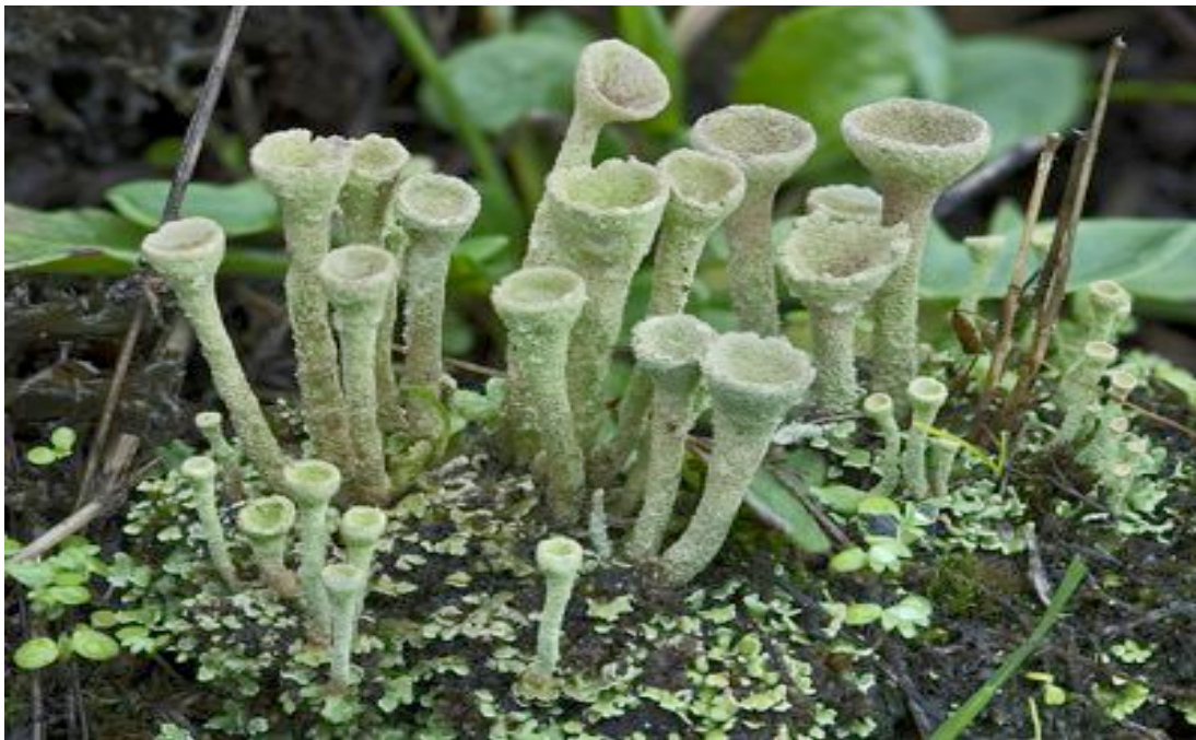
Cladonia chlorophaea (fruticose) with cupped podetia (RD)

(b) Fruticose. Shrub-like, tufted, or pendulous lichens. Their branches are usually round in cross section; if flat, then both sides are the same. On Lummi, be on the lookout for Bryoria , Cladonia (squamulose primary thallus with erect stems or podetia), Evernia , Ramalina , and Usnea .