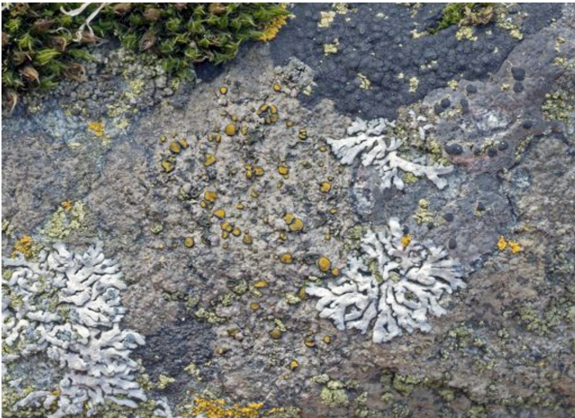
Caloplaca litoricola , Physcia caesia and Hydropunctaria maura (RD)

Calcareous rocks such as limestone and marble contain calcium carbonate (derived from marine organisms). This category also includes some sandstone rocks and even concrete. They are distinguished by their lichen communities, which often include yellow/orange species of Caloplaca , grey species of Physcia , certain Lecanoras , and endolithic species of Hydropunctaria/Verrucaria which can pit the rock surface.