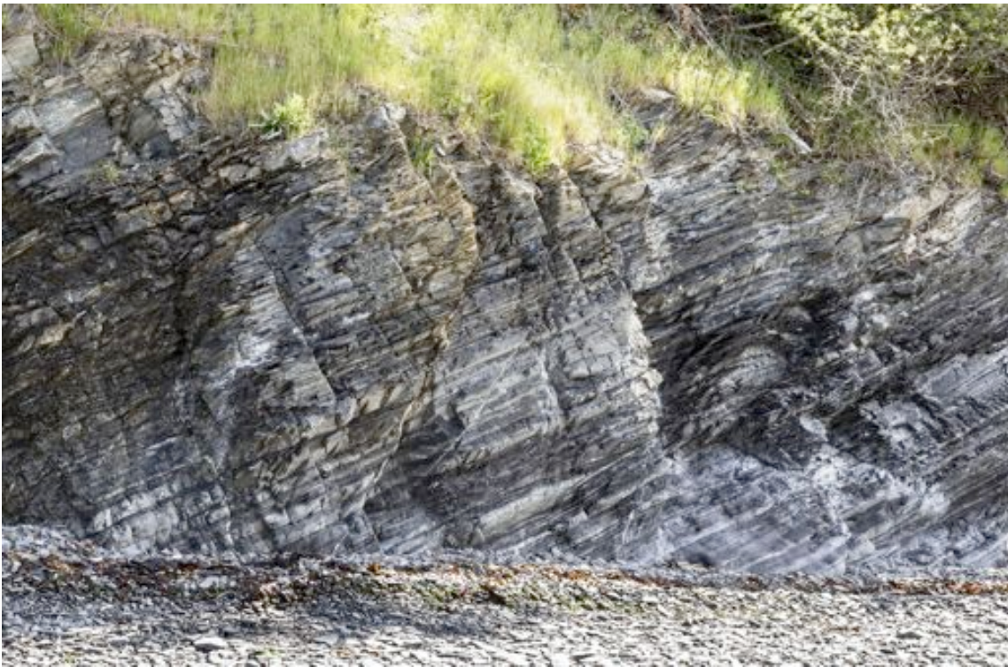
Turbidite along Bird Rock Beach (RD)

Bedrock for the southern mountainous half of the Island is mainly comprised of the “Lummi Formation”. This is a zone of oceanic deposits of the late Jurassic (approx. 161 to 145 million years ago) which have been subjected to low temperature/high pressure metamorphism. The rocks are mainly shale, graywacke, and granule conglomerates. In places beautiful turbidites are exposed, consisting of alternating bands of fine-grained dark and pale coarser sediments.