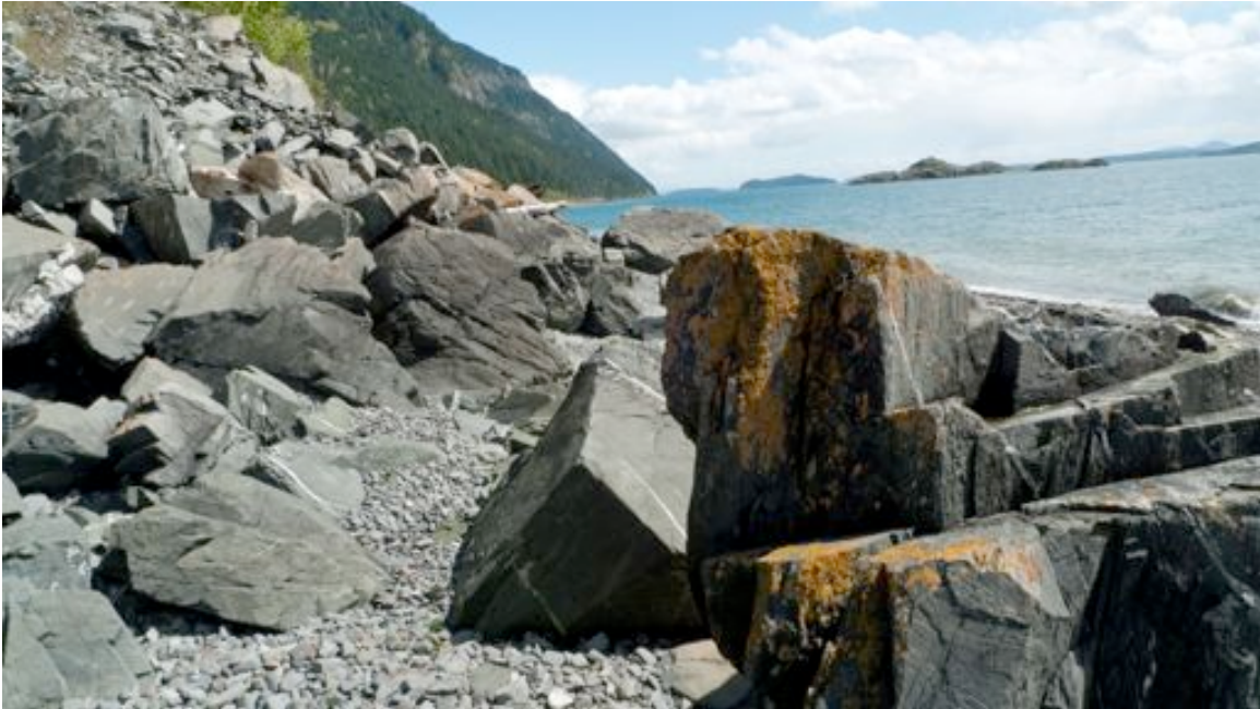
Lummi Rocks (off shore background) (WL)

Specimens were collected of virtually all lichens observed. Voucher specimens will be archived at the Western Washington University Herbarium.