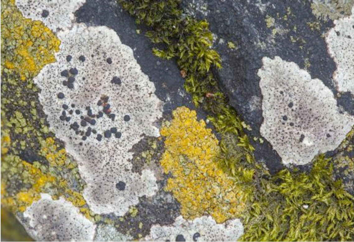
Herteliana alaskensis and Caloplaca flavogranulosa (FR)

* Agonimia tristicula (Nyl.) Zahlbr. = Polyblastia tristicula