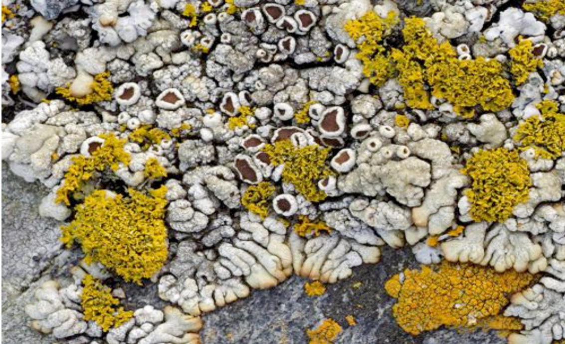
Lecanora straminea (Crustose with brown apothecia) Caloplaca rosei (Crustose), Xanthoria candelaria (Foliose) (RD)