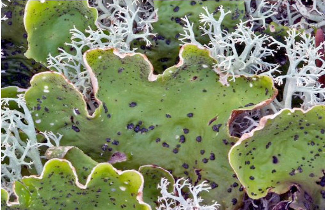
Peltigera britannica (foliose) (RD)

(b) Fruticose. Shrub-like, tufted, or pendulous lichens. Their branches are usually round in cross section; if flat, then both sides are the same. On Lummi, be on the lookout for Bryoria , Cladonia (squamulose primary thallus with erect stems or podetia), Evernia , Ramalina , and Usnea .