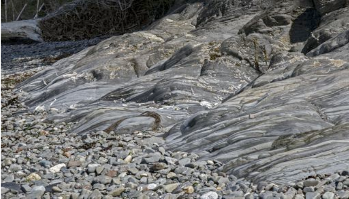
Turbidite along Bird Rock Beach (RD)