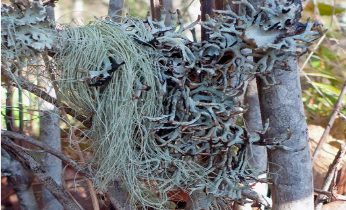
Usnea filipendula (fruticose) and Hypogymnia imshaugii (foliose) (WL)

(c) Crustose - Simple powder-like crusts, smears, or more elaborate structures firmly attached to the substrate (mainly rocks and trees). A few of the more common genera on Lummi include Amandinea , Buellia , Caloplaca , Graphis , Hydropunctaria , Lecanora , and Pertusaria .