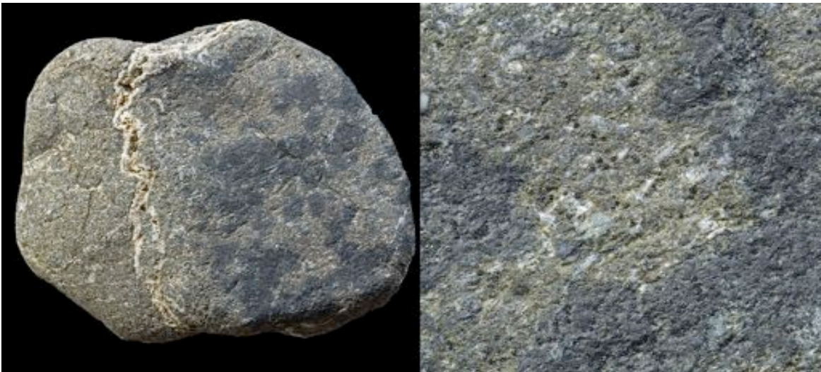
Small rocks below Turbidite are coated with Catillaria chalybeia , a dark crust lichen that is frequently overlooked (RD)

Most bedrock of the northern low and flat half of Lummi Island is of the “Chuckanut Formation”, deposited as river sediments during the Eocene Epoch (approx. 50 million years ago). It is relatively unmetamorphosed and is noted for fossils, particularly plants including palms. Drift and outwash from the Fraser Glaciation (10,000 to 25,000 years ago) covers much of Lummi’s northern half. Lichen substrates there include soil and erratics.