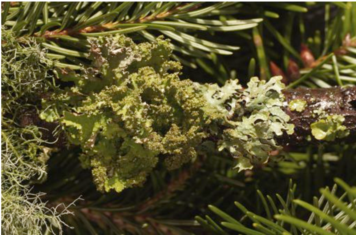
Platismatia glauca and Parmelia sulcata (foliose) (WL)

(a) Foliose. Lichens with a more-or-less flat leafy structure of varying sizes with different upper and lower surfaces. Common genera found on Lummi include Hypogymnia , Parmelia , Peltigera , Physcia , Platismatia , Sticta , Tuckermannopsis and Xanthoparmelia .