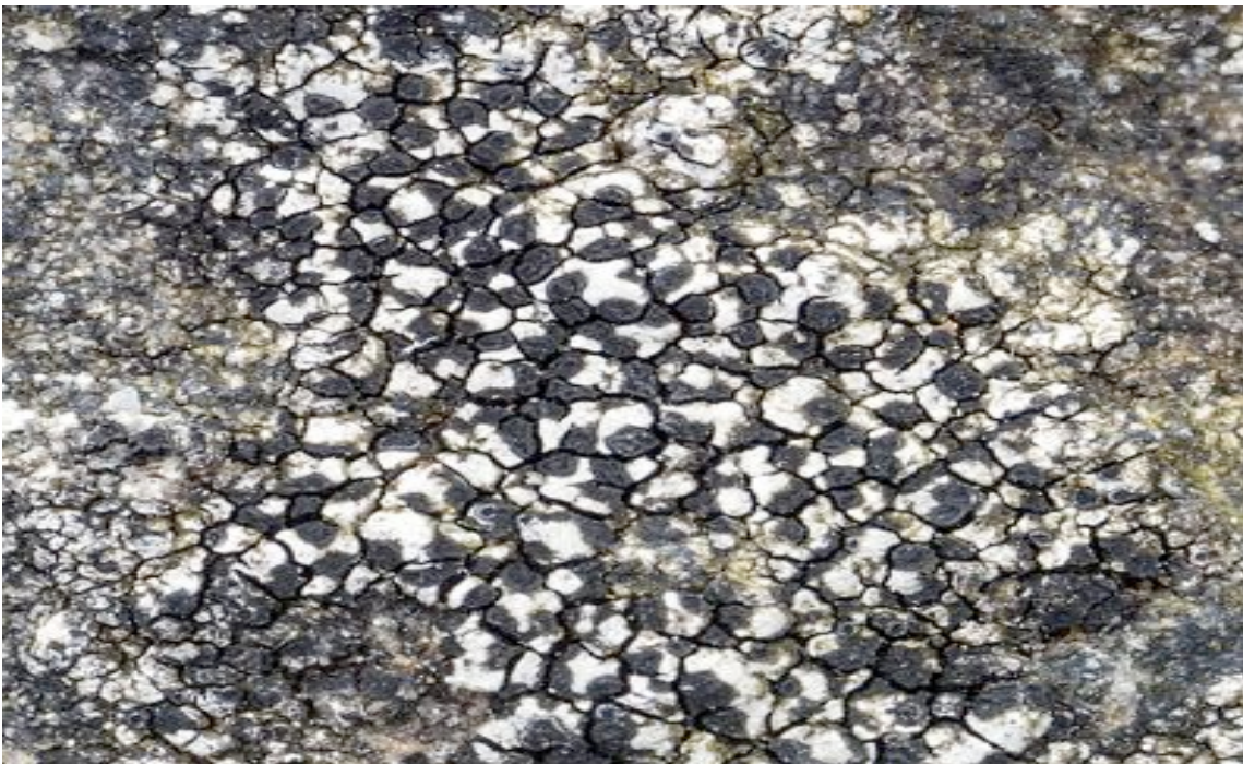
Buellia stelluata (Crustose) (RD)