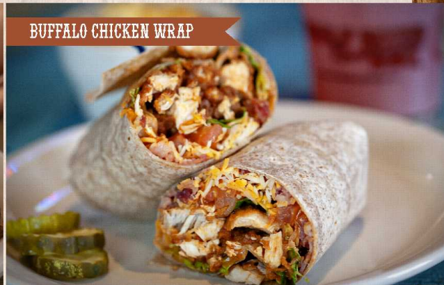
BUFFALO CHICKEN WRAP