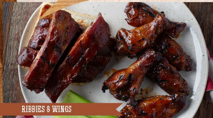
RIBBIES & WINGS