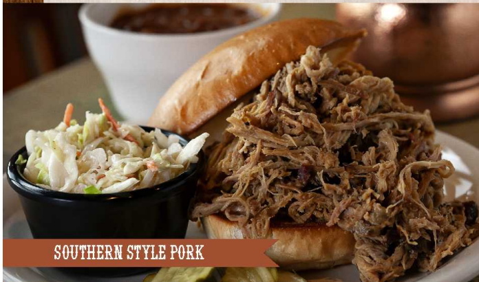
SOUTHERN STYLE PORK

[All sandwiches & wraps are served with a choice of one side dish]