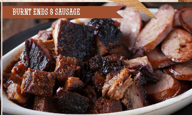
BURNT ENDS & SAUSAGE