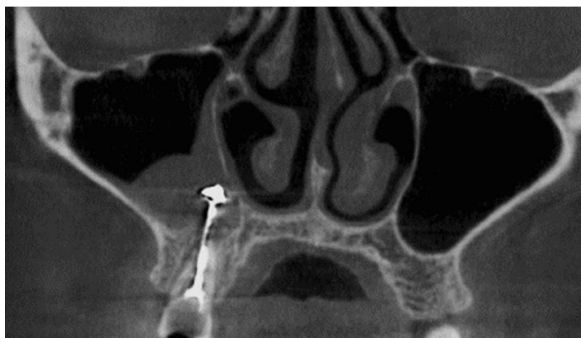
Fig. 1. Iatrogenic maxillary sinusitis of dental origin on the right (mixed form). Cone-ray computer tomography (frontal section).

There have been cases of the development of sinusitis after dental treatment on the background of a new pathological condition, for example, oro-anthral communication (fistula): these circumstances can't be clearly considered a medical error or negative results of treatment. Firstly, because a violation of the integrity of the sinus bottom could be both an anatomical feature and a consequence of chronic inflammation of the periapical tissues of the causative tooth. The appearance of oro-anthral communication (fistula) under the given conditions is rather inevitability depending on the quality of the doctor's work, than the consequence, (figure 2).