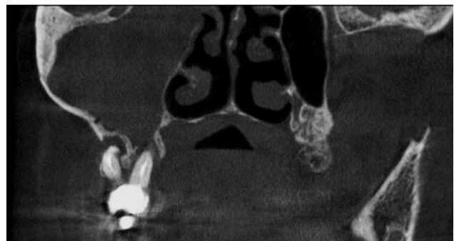
Fig. 2. Iatrogenic maxillary sinusitis of dental origin on the right (infectious-allergic form). Cone-ray computer tomography (frontal section).

The violation of the integrity of the lower wall of the maxillary sinus is determined due to resorption of bone tissue between the sinus and the socket of the "causal" tooth - pathological perforation of the sinus bottom; the presence of a shadow of the root sealant in the projection of the root canals indicates a previously conducted endodontic treatment. Secondly, the removal of the tooth as a cause of inflammation in any case has a therapeutic value, and the oroantral message providing an outflow, facilitates the suffering of the patient (figure 3).