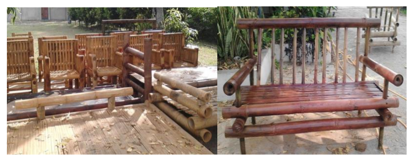
gure 12. Round pole furniture being developed in Mandalay for resorts

Bamboo sticks is however in demand in the export market. These are being exported to Singapore and Holland and used for flower sticks and kites.