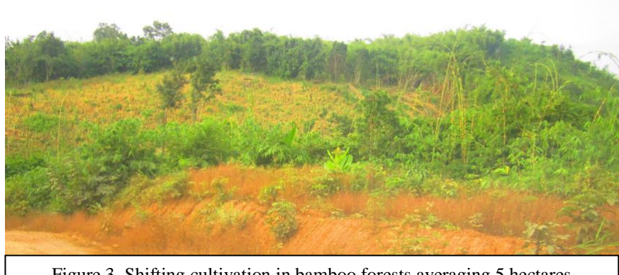
Figure 3. Shifting cultivation in bamboo forests averaging 5 hectares

Field visits in the two villages provided insights on resources in the field. Observations on the actual environmental situation of the forests in the nearby villages, available bamboo resources, status of the vegetation, farm practices, such as shifting cultivation (Figure 3) other crop vegetation, community