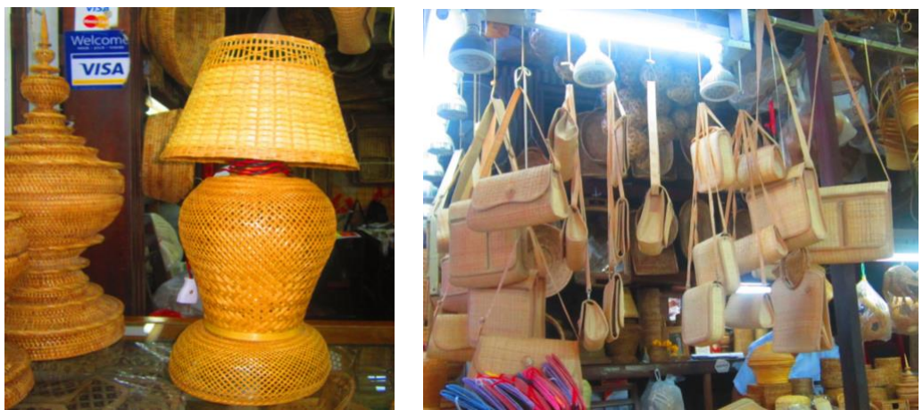
Figure 11. Bamboo products sold in tourist shops

The tourism industry in Myanmar is booming and this is a potential sector for the bamboo products offering more opportunities for value adding. A businessman and plantation owner who was visited in Mandalay was making samples of round pole furniture for beach resorts (Figure 12). At the same time, a training cum production for furniture making was being conducted to trainees coming from different villages.