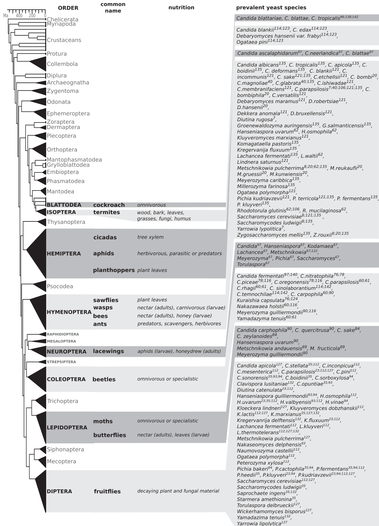
FIGURE 2 Known yeast-insect associations. Yeast species frequently found in the corresponding insect intestine. The insect phylogenetic tree has been adapted from Misof et al (Misof et al., 2014). Superscript numbers refer to the reference as listed in bibliography. Ma, Million years ago.