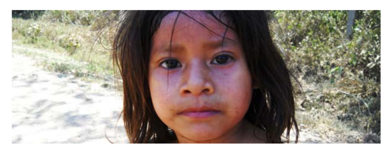
A Yuqui indigenous girl from the Bolivian Amazon. The Yuqui were a people living in isolation until they were contacted by missionaries between 1967 and 1991. Now they are a people in a situation of extreme vulnerability, precisely as a result of this forced contact.

A century ago, in a short story entitled "Tres días en el bosque" (Three Days in the Forest), José Santos Machicado commented: "It would be unimaginable for the Toromonas to abstain from the shrieks and cries that are their custom when they capture a prey or surprise the enemy, and for these cries not to reach the town from such a short distance." (1) The density of images conveyed by this paragraph paint a portrait of the mentality of the era, when positivist thinking prevailed, Winchester rifles were always within reach, and unbridled ambition in pursuit of wealth shook the Amazon rainforest: these were the years of the capitalist boom fuelled by rubber tapping (1880-1914).