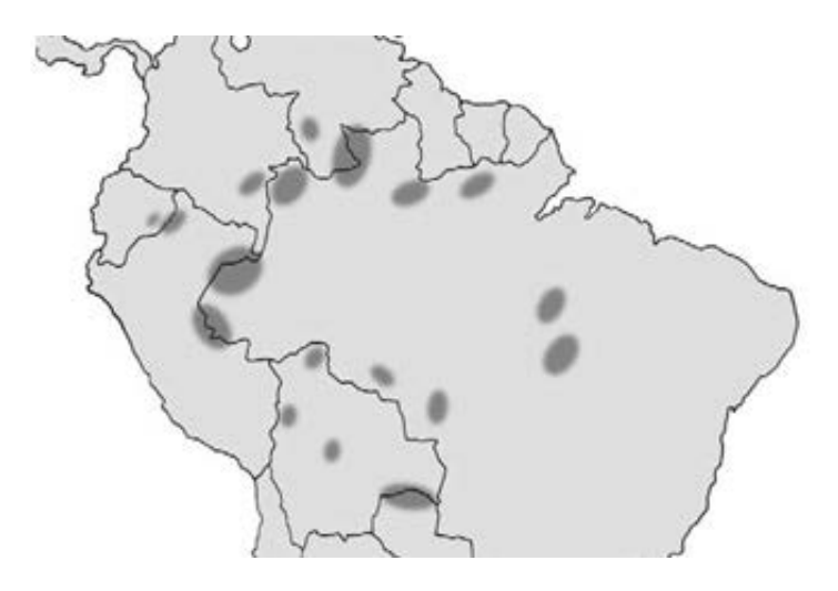
Image: Approximate location of indigenous peoples living in voluntary isolation and initial contact.

Close to 90% of the isolated indigenous peoples still in existence live in the Amazon region, in territories protected by geographical barriers which, to an ever lesser extent, have kept the white man away from the forests where ecosystems and biodiversity are most highly preserved. These peoples have sought isolation as a way to defend themselves from contact that experience has proven to be destructive. Sometimes they have learned this directly through conflicts waged with the white man; at other times they have learned indirectly from the experiences of other peoples who have entered into contact with the outside world.