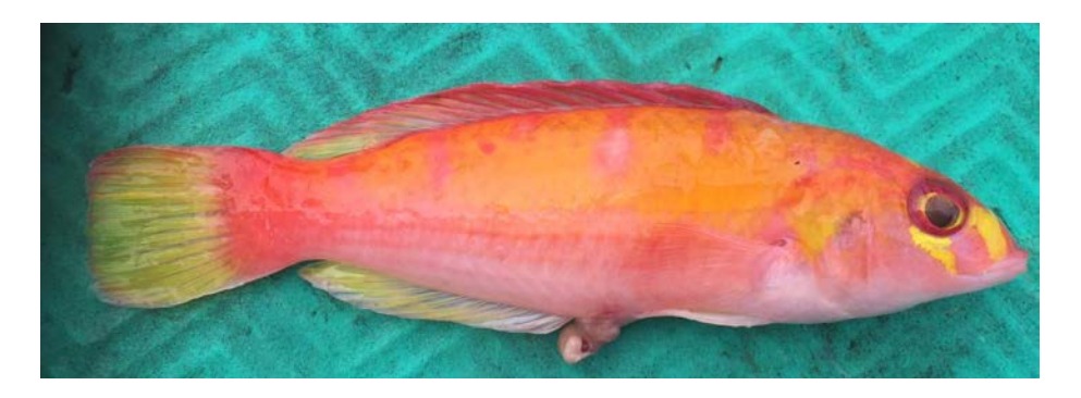
Fig. 3. Decodon pacificus (Kamohara, 1952), ca. 16 cm total length, from Kenting.

Body moderately elongate with dorsal and ventral profile slightly convex. The body depth is about 3.3 times in SL. Head slightly triangular, its length about 3.3 times in SL; snout slightly pointed, with upper lip slightly overhanging the lower lip. Eye large, at margin of upper profile of head, its diameter slightly smaller than snout length, directed laterally rather than dorsally. Mouth small, maxilla extends to a level of anterior half of eye. Caudal peduncle broad, with concave on dorsal and ventral profile.