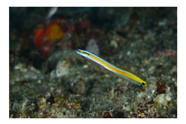
Fig. 2. Underwater photograph of Gunnellichthys curiosus Dawson, 1968 from Kenting.

The individual was found over sand and rubble bottom.