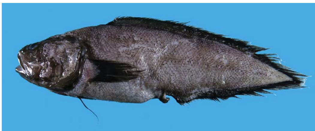
Fig. 1. Freshly caught specimen of Grammonus robustus Smith and Radcliffe, 1913, NMMB-P26419, 148.6 mm SL

Head moderately large (28.6% SL), rather plump, with occiput swollen. Eye small, covered by a circular membrane connected to nearby skin, its diameter 14.4% of head length (HL). Snout short (29.4% HL), very broad and blunt. Interorbital space broad (29.4% HL). Mouth large and oblique; lower jaw entirely included under the upper jaw.