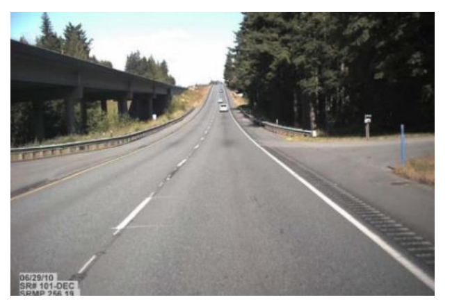
Exhibit 720-1 Phased Development of Multilane Divided Highways

When there is a median gap between bridges of 6 inches or more, the Region PEO will evaluate whether or not the median gap needs to be screened. Address the potential for pedestrians on the bridge and if closing the median gap to less than 6 inches, or installing fencing, netting, or other elements to enclose the area between the bridges would be beneficial. Document this evaluation in the Basis of Design and Alternatives Comparison Table.