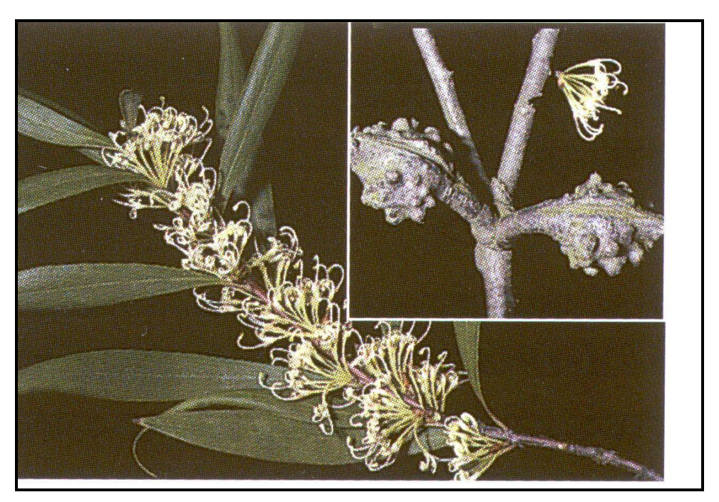
Figure 1. Hakea salicifolia from Blood (2001)

Description: Shrub or small tree, 3–8 m high, glabrous except young growth, which is silky. Leaves 5–10 cm long, 5–15 mm wide, leathery, veins obscure, reddish in new foliage, turning to pale, grayish green or dark green. Flowers small, white, in dense axillary scented clusters. Fruits 2–3 cm long, 1–2 cm wide gray, woody with warty protuberances, splitting into two, each with one winged seed.