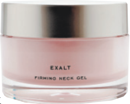
Exalt Firming Neck Gel is a top seller at Bendel's

The products themselves have a variety of cheeky names, ranging from Get a Life!, a $35 treatment fragrance, to Be Gone, a $35, 5-oz. cleansing lotion. The latest products will hit U.S. doors later this spring: a lip