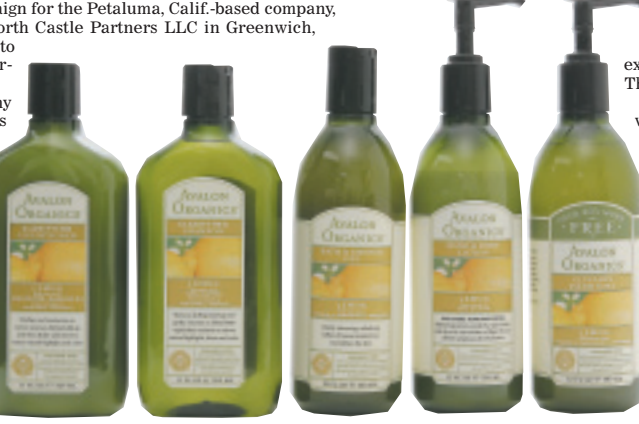
Avalon Organics' new look

"At the base, we are creating products that are safe and clean. Then we are making sure we are not using any chemicals. At the top, we are showing how the natural product industry is representing a laboratory for change. It will soon be backed up by the mainstream."