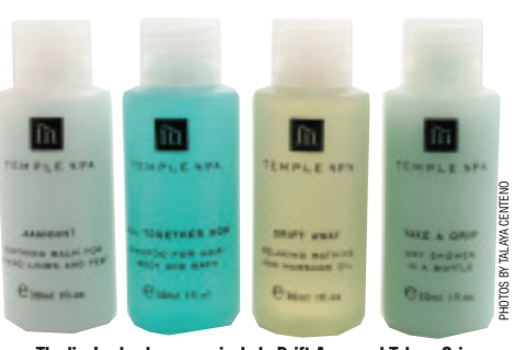
The line's cheeky names include Drift Away and Take a Grip.

balm and a new eye gel. Items in the line range in price from $7.50 for All Mouth Breath Freshening Essence to $60 for Exalt Neck Cream. "Launching a brand from scratch in a new market is always a challenge — but this line is already gain-ing a lot of traction in our door," The Royal Promotion G