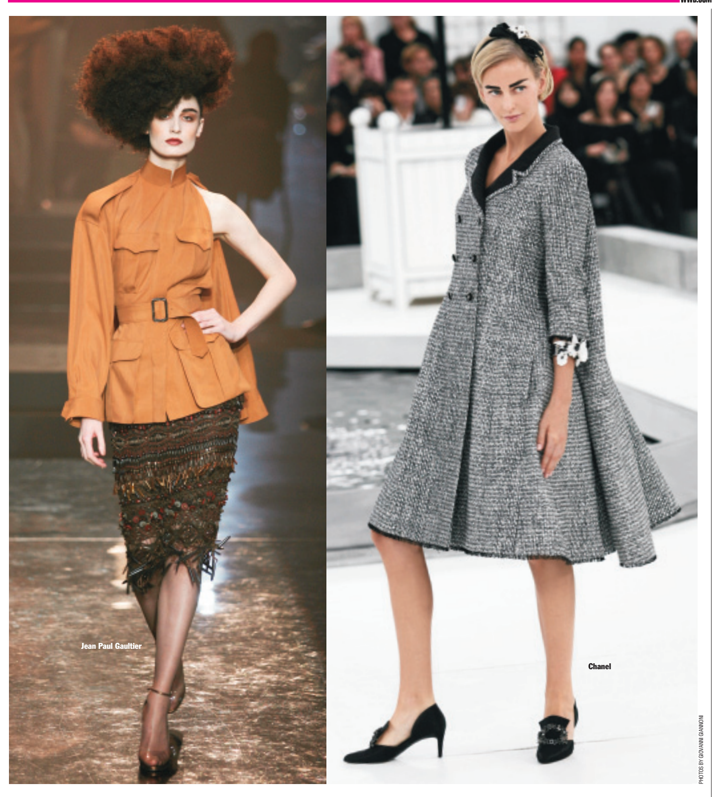
PARIS — There's more to the couture than stunning evening dresses. Once upon a time, most of its customers ordered the then-indispensible, Ladies-Who-Lunch suits, and day clothes still play important roles in the collections today. For spring, for example, there were plenty of great jackets and coats that featured intriguing uses of volume, ranging from John Galliano's truncated little Edie Sedgwick number for Dior to Jean Paul Gaultier's soft, fluid safari jacket, slashed at one shoulder, to Karl Lagerfeld's striking swing-back tweed coat for Chanel.