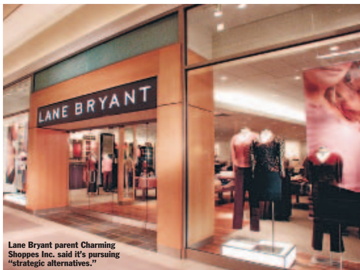
Lane Bryant parent Charming Shoppes Inc. said it's pursuing "strategic alternatives."