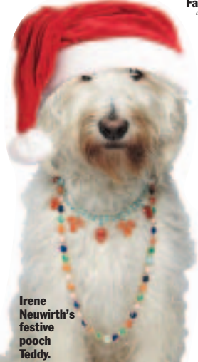
Irene Neuwirth's festive pooch Teddy.