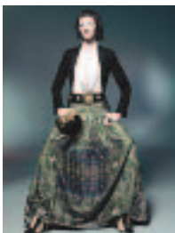
Mariacarla Boscono in an Yves Saint Laurent ad.