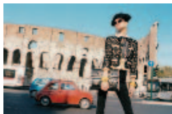
Moschino takes to the streets of Rome.