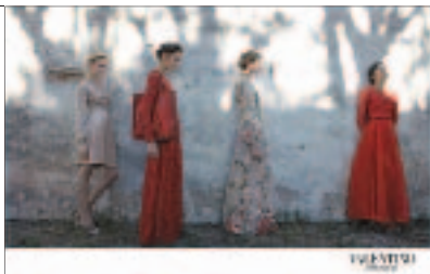
A Valentino image, shot by Deborah Turbeville.