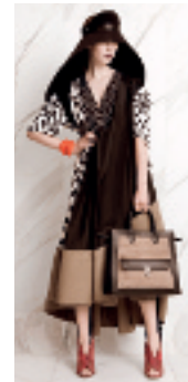
A Balenciaga exclusive for Selfridges.