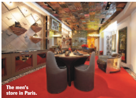
The men's store in Paris.

Louboutin executives said details of the store's design haven't been finalized. However, the appeal of the space is ob-