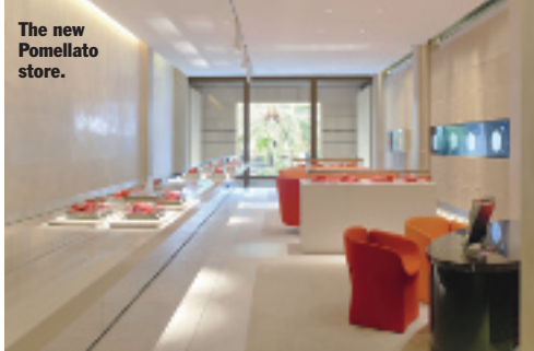
The new Pomellato store.

Morante predicted that once Chinese customers begin traveling to the States en masse,