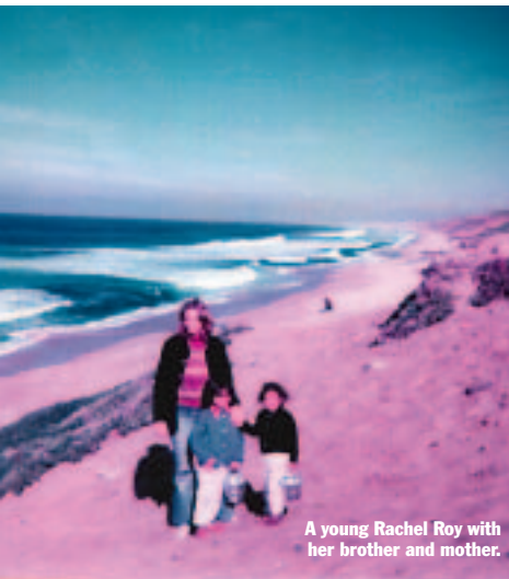
A young Rachel Roy with her brother and mother.