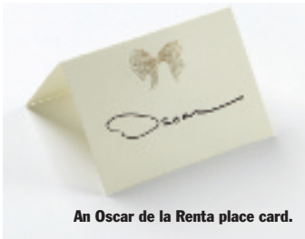
An Oscar de la Renta place card.