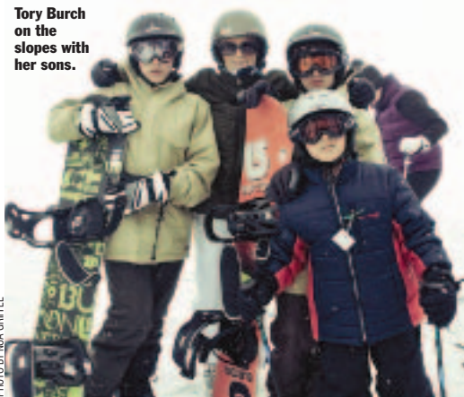
Tory Burch on the slopes with her sons.