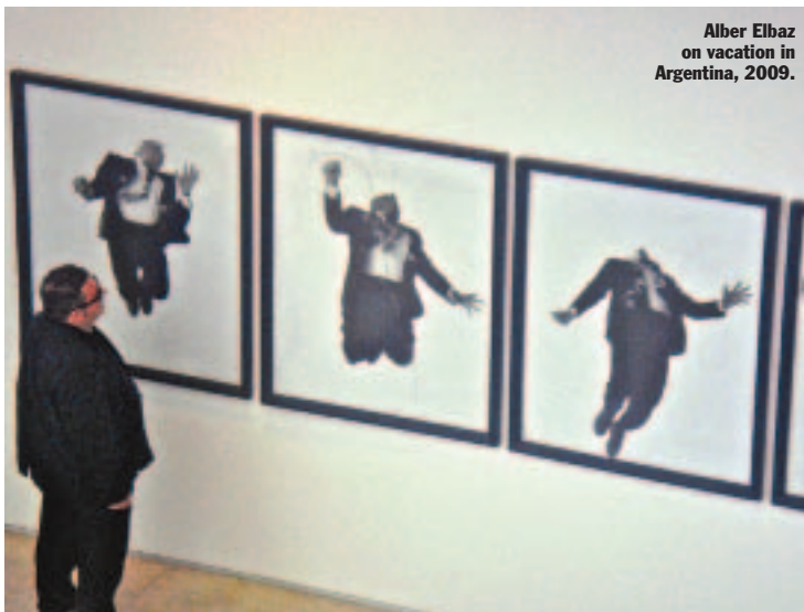
Alber Elbaz on vacation in Argentina, 2009.