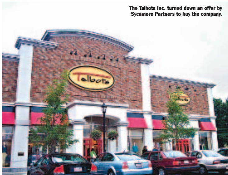
The Talbots Inc. turned down an offer by Sycamore Partners to buy the company.