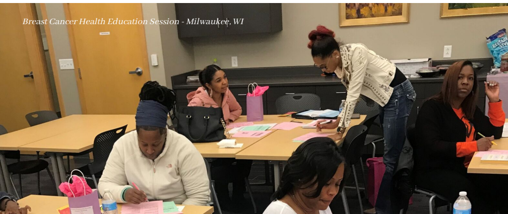
Breast Cancer Health Education Session - Milwaukee, WI

90% of women felt motivated to take action to improve their health