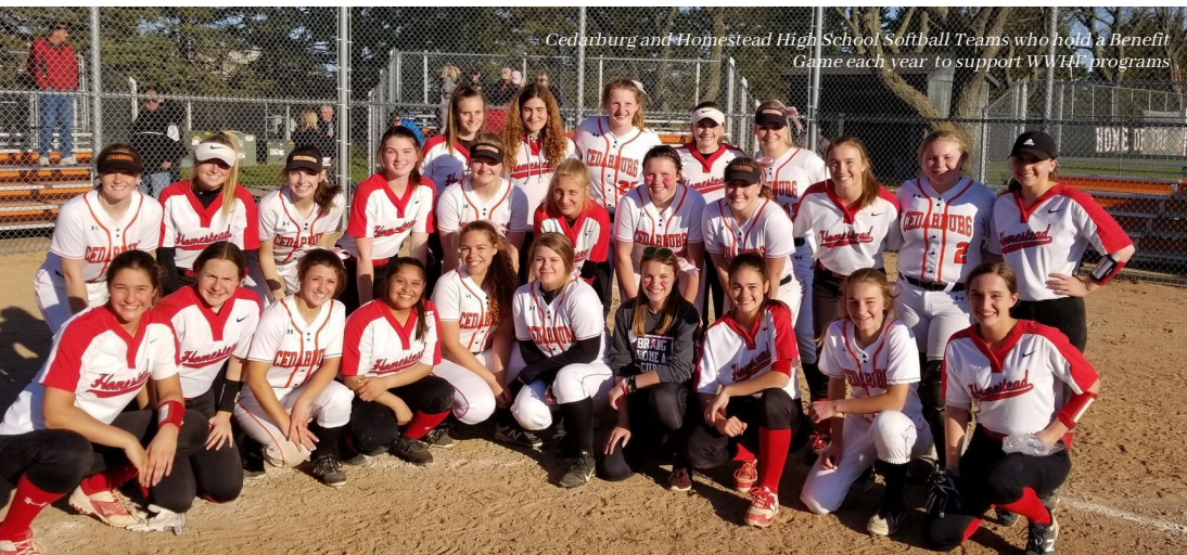
Cedarburg and Homestead High School Softball Teams who hold a Benefit Game each year to support WWHF programs

With your support, we continue to innovate, impact, and improve women's health in Wisconsin for thousands of individuals!