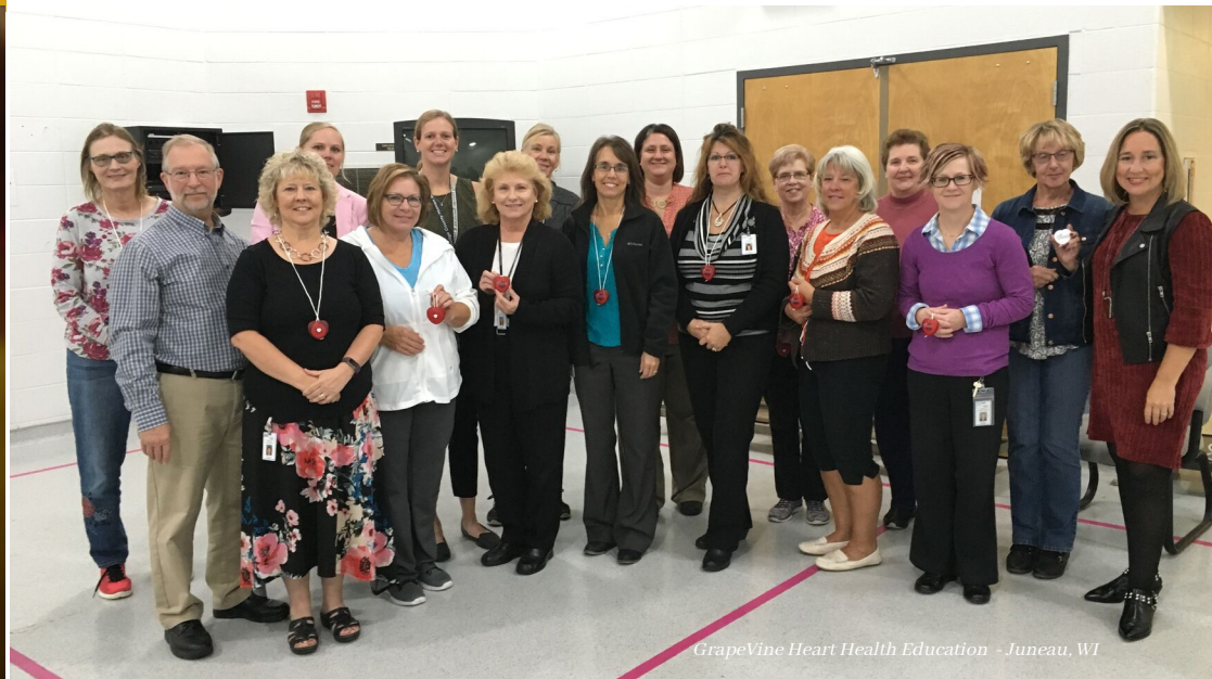
GrapeVine Heart Health Education - Juneau, WI