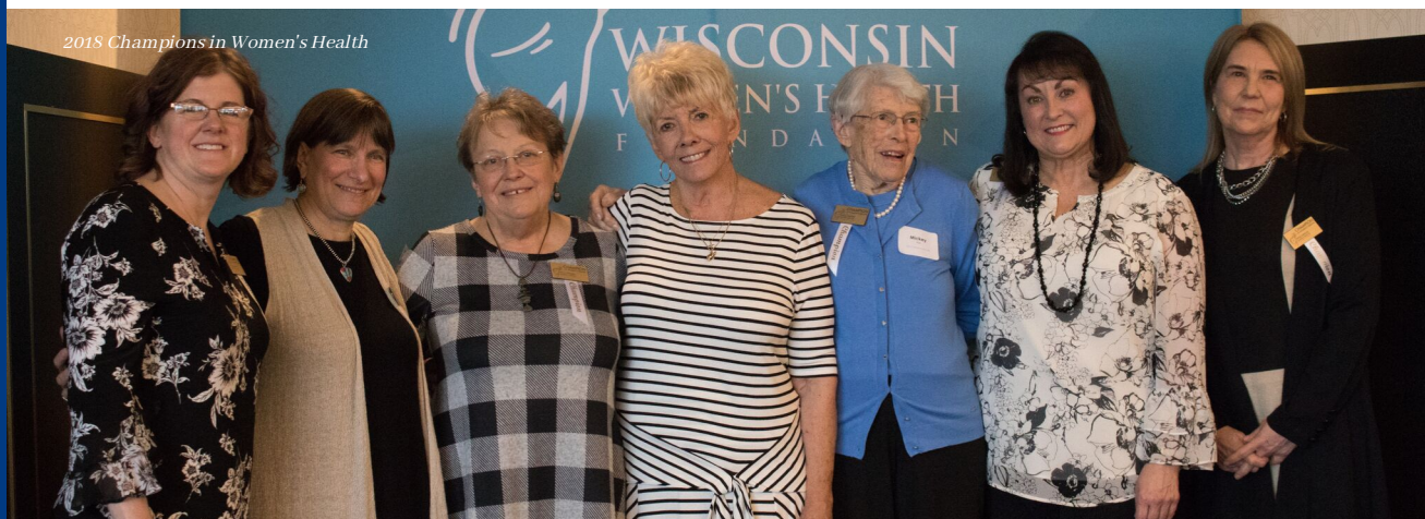
2018 Champions in Women's Health