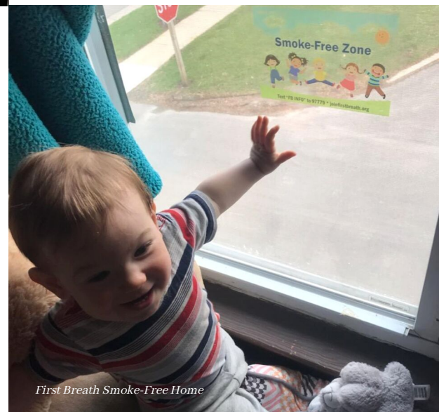
First Breath Smoke-Free Home

after an initial referral by the Well Badger Resource Center.