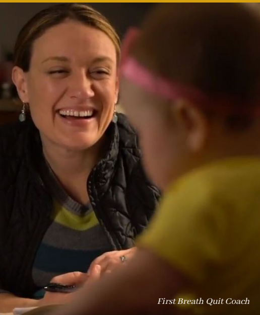
First Breath Quit Coach

*View individual program reports at www.wwhf.org/about/annual-reports/