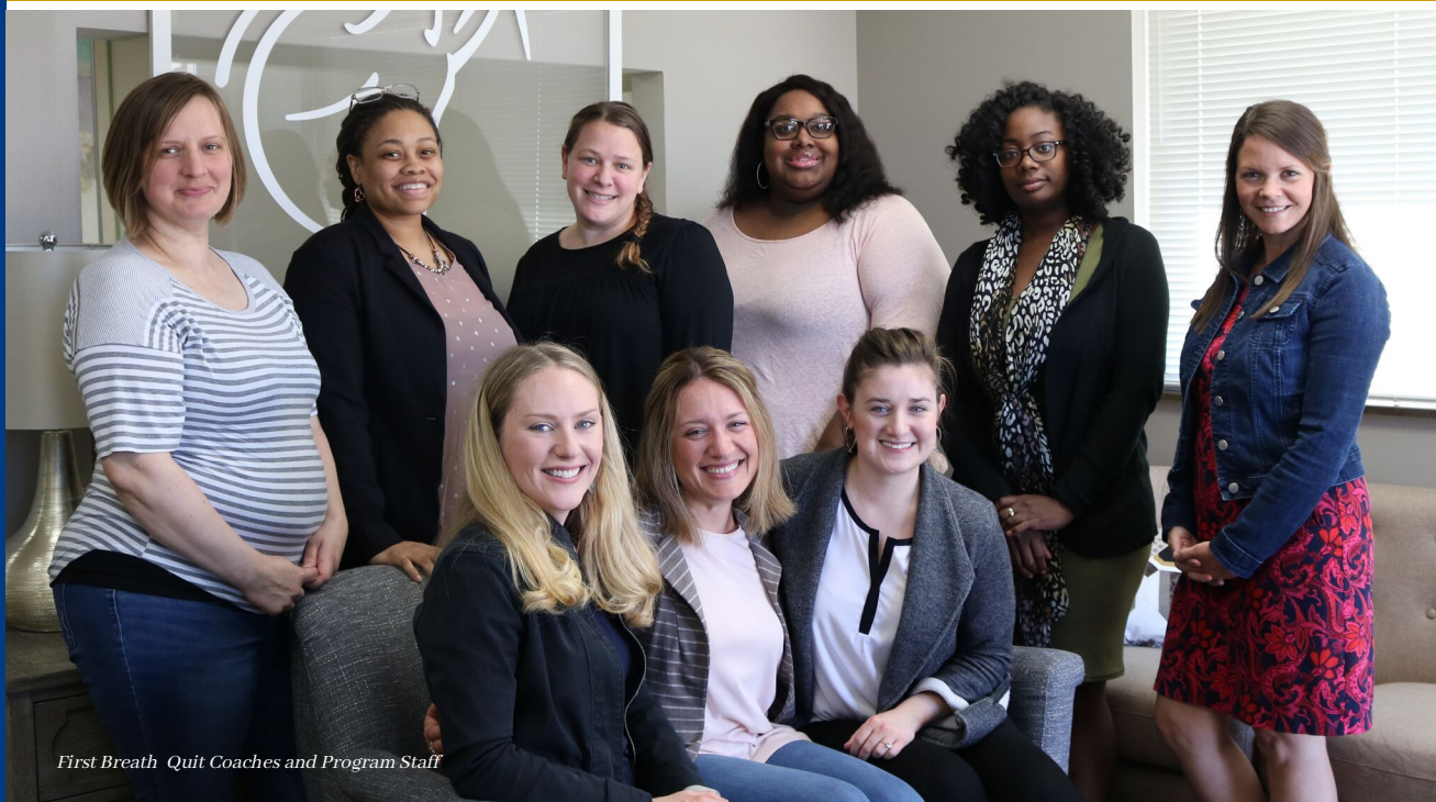
First Breath Quit Coaches and Program Staff

The Wisconsin Women's Health Foundation (WWHF) is a nonprofit organization that provides free health services and education for women and families in Wisconsin. We have five statewide programs in all 72 counties, serving over 7,000 women each year. WWHF services and research initiatives are rooted in evidence-based prevention of the diseases and conditions that most affect Wisconsin women.