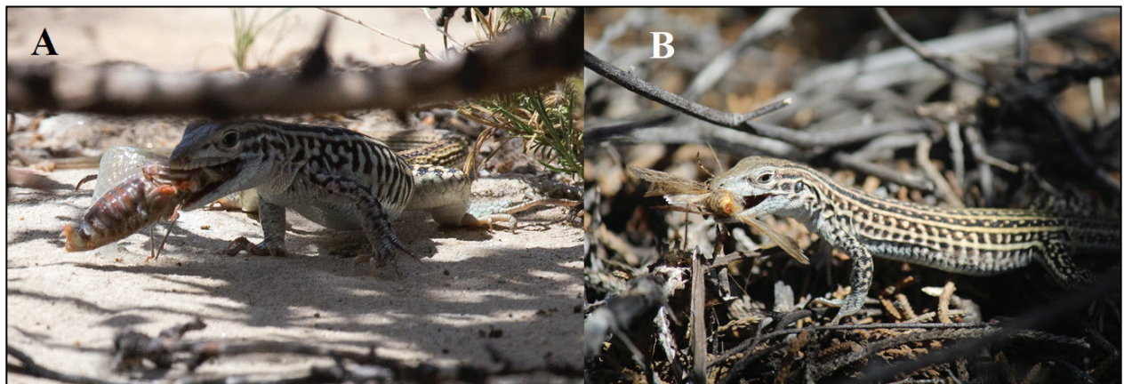
FIGURE 3. Two Aspidoscelis neotesselatus (Colorado Checkered Whiptail) in the U.S. Army Fort Carson military installation, Pueblo County Colorado. (A) A near maximum sized adult with a problematic dorsolateral color pattern for pattern class A (estimated > 92 mm snout-vent length [SVL]) with a large Putnam's Cicada ( Platypedia putnami , family Cicadidae); photographed 28 May 2018 at a woodland study site TA55. (B) Adult of pattern class A (estimated > 80 mm SVL), based on six persistent primary stripes and absence of a complete vertebral line, with a moderately large Miller Moth ( Euxoa auxiliaris , family Noctuidae); photographed 9 June 2019 at the grassland study site.

lizards described in this paper. We surmised that photographed lizards from FC, based on Walker et al. (1997, 2012), Taylor et al. (2015b), and Aubry et al. (2019), were from arrays of A. neotesselatus pattern class A (Fig. 2–3), whereas both pattern classes A (Fig. 4) and B (Fig. 5) were photographed in Denver County (Livo et al. 2019). Observations in FC in May through July revealed that individuals of A. neotesselatus , under favorable environmental conditions, typically begin to emerge from overnight retreats by 0800–0830 (Mountain Daylight Time), usually bask to elevate body temperature, and then typically forage with intermittent basking until 1100–1130. On 25 June 2019 at 1015, we photographed an example of foraging by a second-year subadult lizard (Fig. 2). We identified it as an individual of pattern class A of Colorado Checkered Whiptail based on the dorsal pattern of six complete pale-colored primary stripes, a series of pale-colored vertebral components rather than