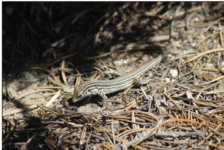
FIGURE 2. Second year juvenile Aspidoscelis neotesselatus (Colorado Checkered Whiptail) of pattern class A (estimated < 60 mm snout-vent length) foraging in thick ground litter; photographed 25 June 2019 at a woodland study site TA55 in U.S. Army Fort Carson military installation, Pueblo County, Colorado.

modeling to better inform A. neotesselatus conservation concerns. Many of these activities were parts of a larger project in FC led by LMA of Colorado State University on the demography and physiology of A. neotesselatus . Binoculars permitted collection of data for statistical analyses of search behaviors in lizards of different size classes from distances that would not distract the lizards from normal activities. Other field activities were led by LJJ to access the extent of the distribution and impact of the newly discovered arrays of A. neotesselatus in Adams and Denver counties. Neither A. tessellatus nor A. sexlineatus were syntopic with A. neotesselatus at any of the study sites in FC, although A. sexlineatus was syntopic with A. neotesselatus in parts of Adams and Denver counties.