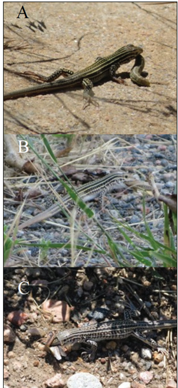
FIGURE 4. Second year juvenile Aspidoscelis neotesselatus (Colorado Checkered Whiptail) from an introduced array in Denver County, Colorado. (A) Individual of pattern class A (estimated > 55 mm snout-vent length [SVL]), based on the dorsal pattern, with a large larval lepidopteran; photographed 1 June 2018. (B) Individual of pattern class A (estimated > 50 mm SVL), based on the dorsal pattern, with an adult orthopteran; photographed 29 June 2019. (C) Individual of pattern class A (estimated > 65 mm SVL), based on the dorsal pattern, with an adult orthopteran; photographed 21 July 2019.

On 9 June 2019 at approximately 1035, we encountered a prey-capture event involving an adult A. neotesselatus with six unfragmented primary dorsal stripes typical of pattern class A (Walker et al. 1997). The lizard was observed at the grassland site in Pueblo County designated TA48 (see habitat photograph in Aubry et al 2019, Fig. 2; Fig. 1 this study). Although the area was characterized as a predominantly grassland site in the study of habitat-dependent search behavior in A. neotesselatus (Utsumi et al. 2020), towards the edge of the plot was a mixed assemblage of One-seed Juniper ( Juniperus monosperma ) and Pinyon Pines ( Pinus edulis ). The lizard was observed in a thick layer of woody debris that had accumulated under the canopy of a large One-seed Juniper (Fig. 3B) with a winged insect in its jaws. The lizard remained stationary with an eye trained on the observer. Individual A. neotesselatus often can be closely approached by stealth, thus the observer saw that the lizard continued to chew on and orally manipulate the insect before it was swallowed. The prey was subsequently identified as a Miller Moth ( Euxoa auxiliaris ) in the family Noctuidae, members of which often achieve what some observers consider a ubiquitous and noxious presence in Colorado in spring