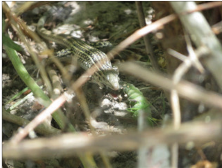
FIGURE 5. A third or fourth year adult Aspidoscelis neotesselatus (Colorado Checkered Whiptail) of pattern class B (estimated > 75 mm SVL), based on zig-zag continuous vertebral line, with a giant lepidopteran larva; photographed 12 August 2019 from an introduced array in Adams County, Colorado.

arrays in MD including parts of Denver and Adams counties (Fig. 1). On 1 June 2018 at 0909, we encountered a second season juvenile in Denver County with the head of a large larval lepidopteran in its jaws. The lizard was initially encountered on an open slope with scattered grass. It dropped the insect at least twice before picking it up and beginning to ingest it (Fig. 4A). On 29 June 2019 at 1052, we encountered another second season juvenile with a lengthy regenerated tail in Denver County, along the edge of a level gravel path with a partly (and then more fully) ingested orthopteran prey (Fig. 4B). On 21 July 2019, we observed a third second season juvenile in Denver County, struggling with a grasshopper on the open ground near weedy plants (Fig. 4C); the lizard pressed the grasshopper into the ground and adjusted the insect in a more headfirst position and then finished consuming it within about a minute. On 12 August 2019 at 1213, we encountered a third or fourth season adult of pattern class B in Adams County; the lizard was clamping the head of a large larval lepidopteran in its jaws. Over the approximately 3 min of observation, on two occasions the lizard dropped the caterpillar, adjusted its position, and resumed its efforts to consume it (Fig. 5).