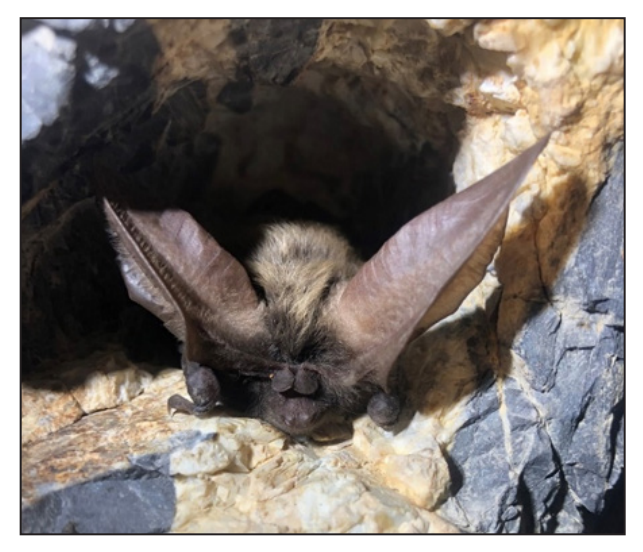
FIGURE 3. A solitary Allen's Big-eared Bat ( Idionycteris phyllotis ) roosting in a drill hole in the Sueños Mine 28 January 2021, Sierra County, New Mexico.

To date, all known winter observations of Allen's Big-eared Bats are female from both abandoned mines (observations discussed above) and captures over water sources from November to March: one female captured over stock tank 10 March 2005, Grant County, New Mexico, 1,542 m elevation (Geluso 2007) and