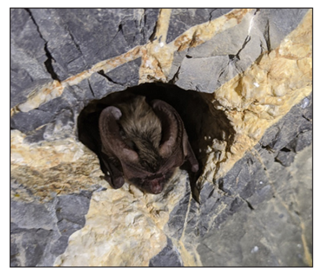
FIGURE 2. A solitary Allen's Big-eared Bat ( Idionycteris phyllotis ) roosting in a drill hole in the Sueños Mine 9 January 2020, Sierra County, New Mexico.