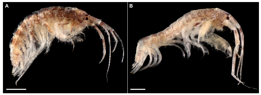
Figure 2: (A) female and (B) male of Grandidierella japonica Stephensen, 1938 from the Gulf of Morbihan (V10 and Garenne respectively). Scale bars: 1 mm.

The maximum length observed was 8 mm for an ovigerous female and up to 7.5 mm for the larger male.