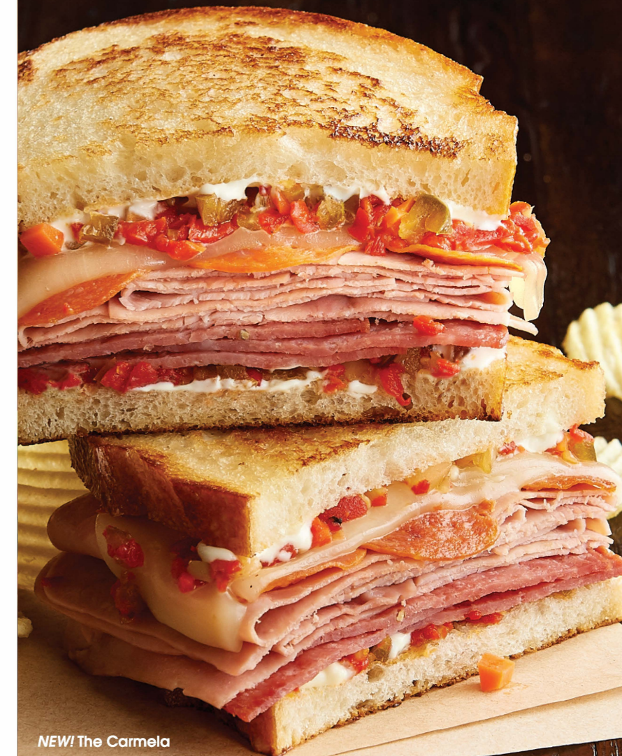
NEW! The Carmela