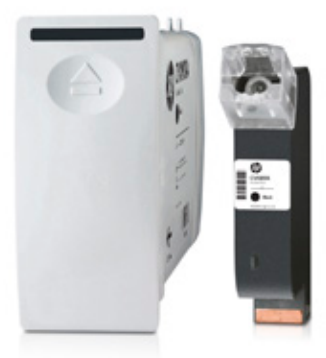
Bulk ink cartridge