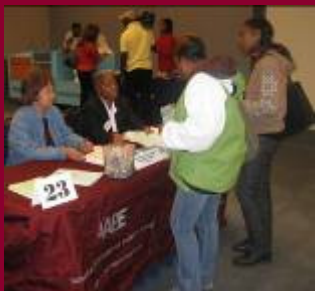
AABE Washington DC Metropolitan Area Chapter at the Energy Expo