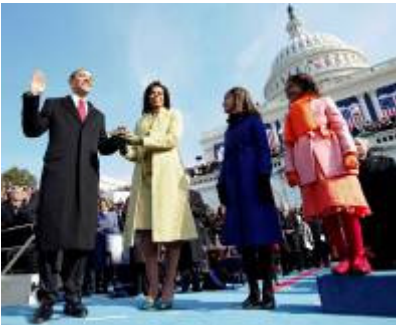
The First Family of the US - President Barack Obama, First Lady Michelle, Malia and Sasha.