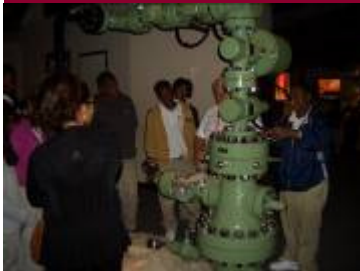
AABE Houston Chapter Explores Weiss Energy Hall with students