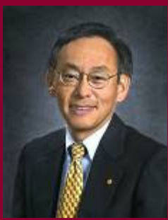
Dr. Steven Chu, Ph.D. Is the 12th United States Secretary of Energy

AABE's National Energy Policy Principles include strategies on Climate Change, Renewables Technology, and Energy Efficiency.