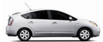
2009 Toyota Prius