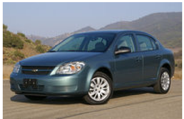
2009 Chevrolet Cobalt XFE

A showcase of green vehicles will be available for viewing at the 32nd Annual AABE National Conference in Orlando from April 14th to 17th at the Rosen Shingle Creek Resort