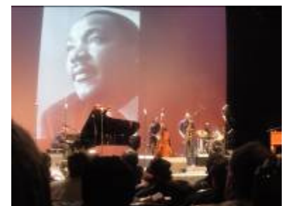
The Brooklyn Academy of Music's 23rd Annual Tribute to Dr. Martin Luther King Jr