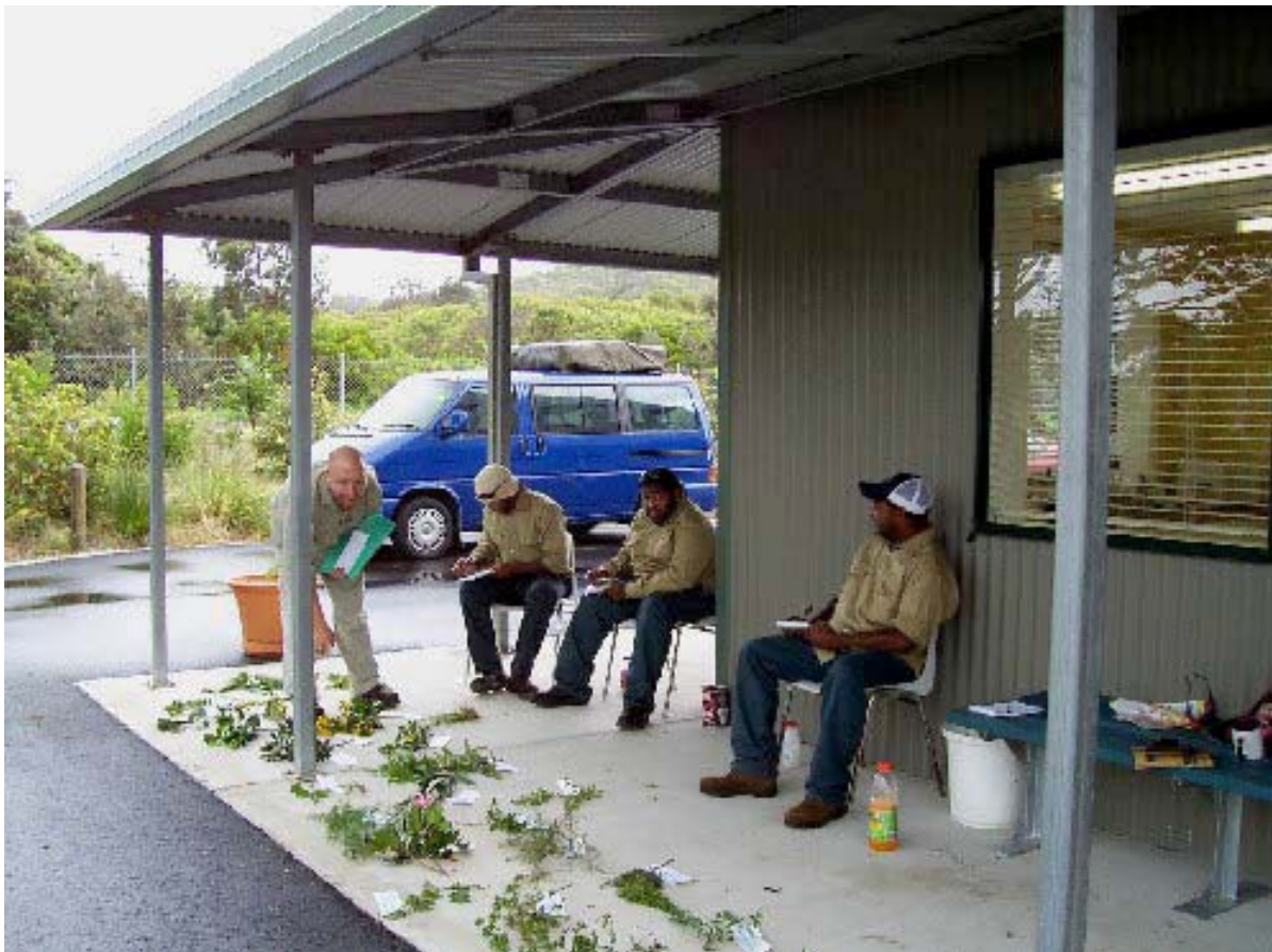
Plate 2: Private bush regeneration trainer conducting a weed identification course with Community Development Employment Program and National Parks and Wildlife Service employees, Arakwal Community, Byron Bay, NSW, 2006.

Qualifications in bush regeneration were originally acquired through a course provided by the National Trust and later through tertiary institutions, especially Technical and Further Education Training Colleges (TAFE). Now bush regeneration qualifications are attained through the nationally accredited Conservation and Land Management (Natural Area Restoration) Training Package.