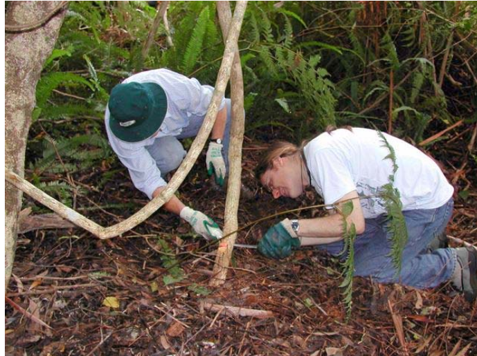
Plate 3: Teaching a volunteer how to poison lantana using the stem frill technique in Ku-ring-gai Flying-fox Reserve, Sydney

(AABR NSW) in 1986. AABR aims to foster the application of sound ecological practices of bushland management by qualified people and to promote the study and practice of bush regeneration (AABR 2006a). AABR Far North Coast & South East Queensland was established a few years ago as a sub-group of AABR NSW. AABR WA is a sister organisation in Western Australia. It is hoped that further groups will establish throughout Australia as the industry grows.