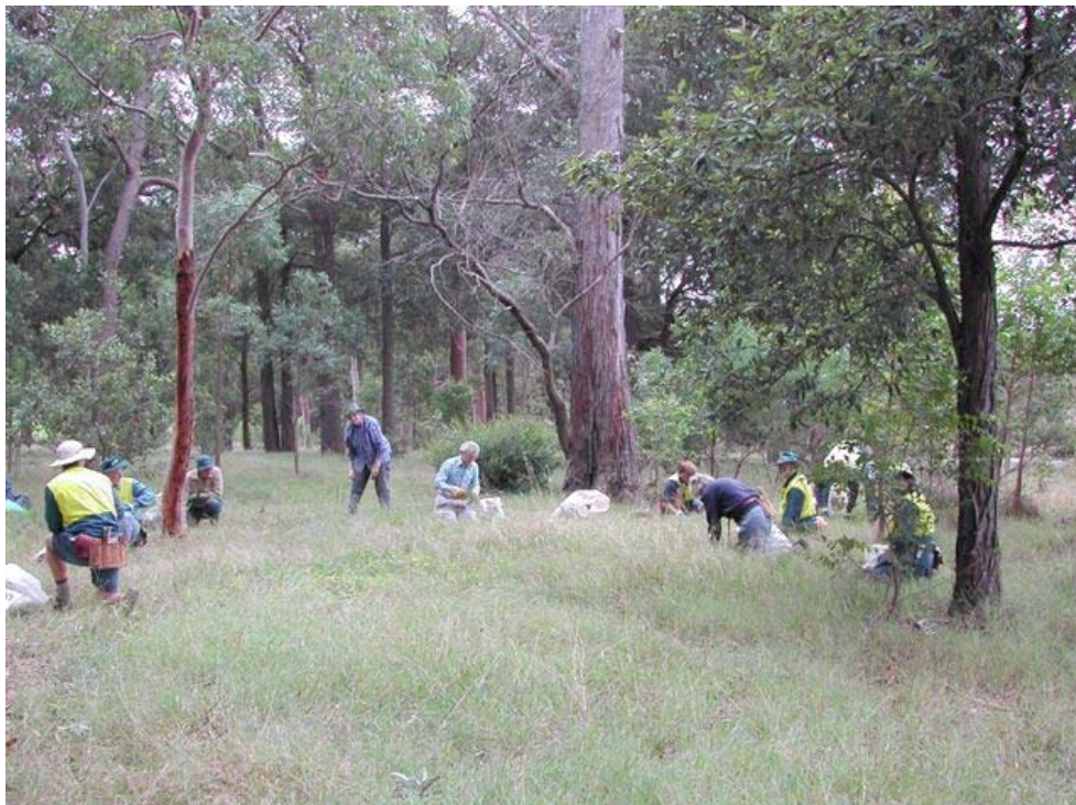
Plate 4: Volunteers and Council staff together regenerating the understorey of Sydney Turpentine Ironbark Forest, a critically endangered ecological community at Killara Park, Sydney

From data provided by respondents it was estimated that the overall paid and volunteer value of the bush regeneration work carried out in the study areas in 2005 was approximately $18 million of which 72 per cent was for paid work ($12.9 million) and 28 per cent was for volunteer work (valued by the respondents at $5.1 million). Each volunteer worked an average of about 40 hours during 2005 but this average rose to 65 hours in the municipality-based areas which commonly have council bushcare programs that organise regular weekly or monthly work sessions.