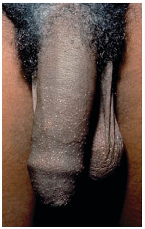
Figure 5. Lichen nitidus. Multiple pinheadsized, slightly elevated, discrete, hypopigmented papules.

not require treatment.<sup>31,33</sup> Patients rarely experience pruritus.<sup>32,33</sup> The course of lichen nitidus is variable and can resolve spontaneously.<sup>31</sup> When treatment is indicated for cosmesis, options include corticosteroids, vitamin A analogues, cyclosporine (Sandimmune), itraconazole (Sporanox), and phototherapy.<sup>33</sup> Laser ablation should be avoided because of the potential for scarring.<sup>31</sup>