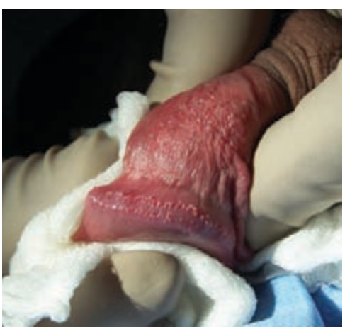
Figure 6. Pearly papules. Distribution of multiple, small, dome-shaped, skin-colored papules with ring-like distribution on the coronal sulcus.

Lichen planus is also uncommon. It is typically systemic, affecting mucous membranes, nails, acral sites, and the scalp.<sup>34</sup> One fourth of patients with lichen planus have lesions on the genitalia, and most patients also have extragenital involvement.<sup>35</sup> Lichen planus lesions are raised, violaceous, flat-topped, polygonal papules<sup>36</sup> ( Figure 7 ). Fine white streaks (Wickham striae) may appear on the surface of the lesions. In uncircumcised patients, the lesions assume a lacy, white, reticulated pattern. Patients with lichen planus often