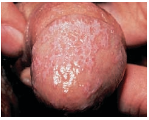
Figure 7. Lichen planus. Raised, violaceous, flat-topped, polygonal papules.

complain of pruritus and soreness. Lesions may be associated with ulceration.<sup>34</sup> Ulcerated or indurated lesions may suggest squamous cell carcinoma and require a biopsy.<sup>37</sup>