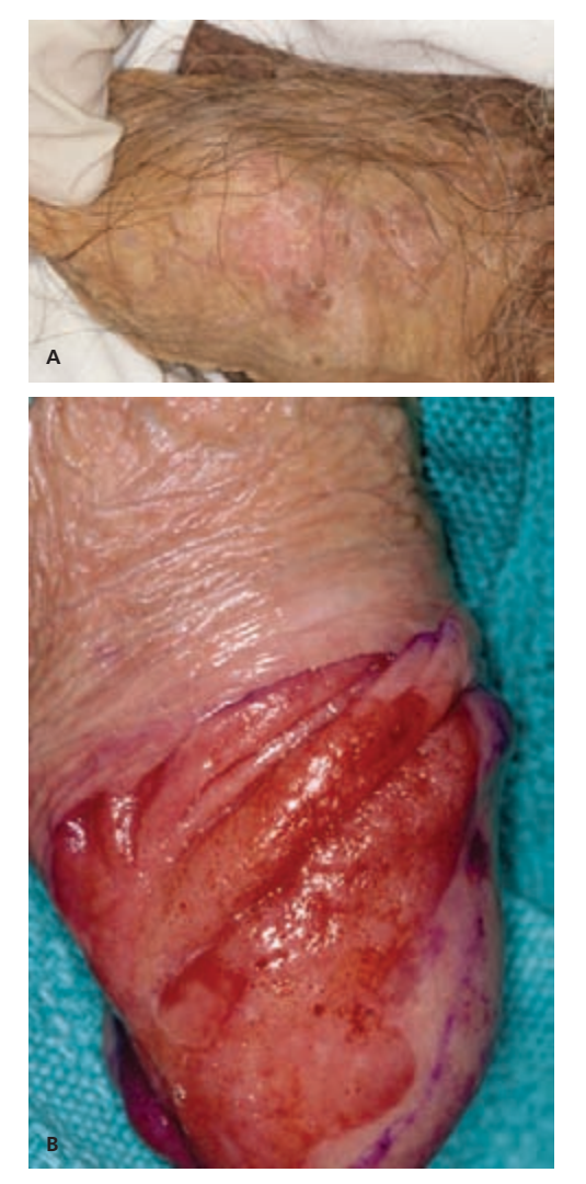
Figure 3. Carcinoma in situ. ( A ) Bowen disease presenting as erythematous plaque with soft, white scales; appearance is similar to psoriasis. ( B ) Characteristic raised, beefy red, velvety plaque.

is needed in patients with persistent disease or a history of squamous cell carcinoma.<sup>18</sup> Circumcision may be indicated in patients with lichen sclerosus limited to the glans penis and prepuce. Severe cases may require reconstructive surgery,<sup>16,19</sup> although conservative management may be appropriate if the risks of surgery outweigh the potential benefits.<sup>16</sup> Systemic agents, such as retinoids, are reserved for severe cases of lichen sclerosus and when local therapy fails.<sup>19</sup> Longterm follow-up is appropriate to monitor for malignant transformation.<sup>18</sup>