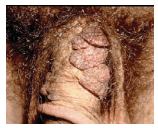
Figure 9. Giant condyloma. Appearance is similar to exophytic squamous cell carcinoma.

erode. Although Zoon balanitis is benign, the lesions may mimic carcinoma in situ; therefore, biopsy is needed.<sup>6,19,36</sup>