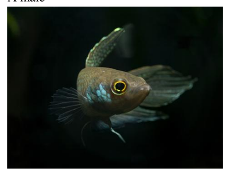
Another male sharing the same tank