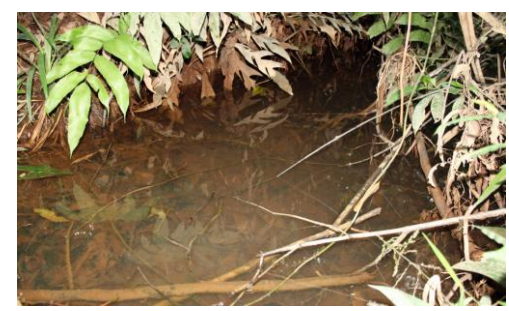
Close up view of the habitat.

Salihan having trouble getting the Betta lehi to eat the worm as most of the lehi here are juveniles. In short,the worm is too big for them to eat.in the beginning,he caught 15 rasboras .However after changing the bait,his luck changed.