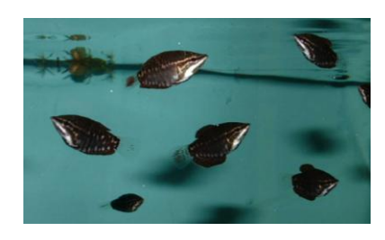
REPRODUCED WITH PERMISSION AND THANKS FROM PRESTON AND DISTRICT AS MAGAZINE

day After 20 days of not eating, he started to release the young fry, a spitting image of their parents, even at that size). I found about twenty odd fry and started feeding Infusoria for the first couple of days, then brine shrimp, then Grindal worm. I removed the female for safety, but since have found them to be good parents. They don't touch the young which are now 30 days old and trebled in size.