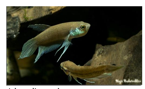
A brooding male

Notice the damaged scales on the female ......During spawning both the female and male constantly chase away the other pair when they venture too close to their territory.