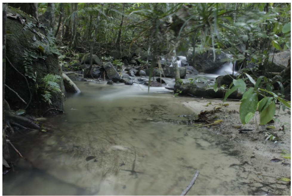
Biotope of B. sp. aff. Lehi , in a mineral poor arm of the stream. Another hard water side arm is home to B. ferox,- Taman Negara Perlis, Malaysia

these fish were a B. fusca type, probably the B. sp. aff. lehi .