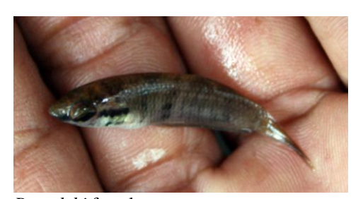
Betta lehi female