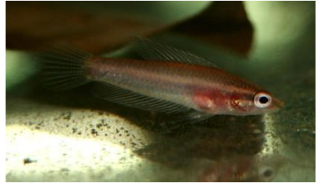
P. allani Sibü