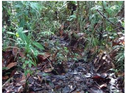
Another view of the habitat.

After crossing the drain into the jungle, this is how the habitat looks like. Very similar to the one in Matang. Even the type of fishes and shrimps caught here are the same type as those in Matang.