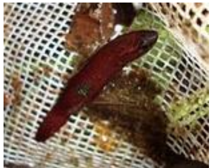
Catch of the day, Betta brownorum .