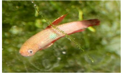
A female Betta brownorum Sibü