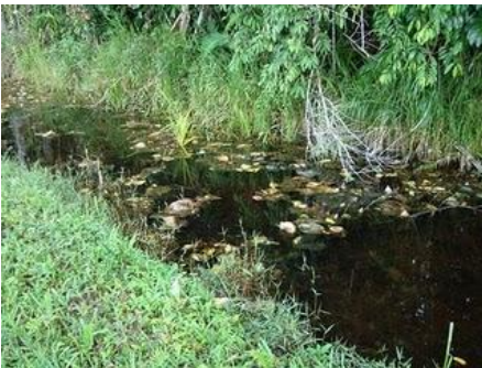
A polluted drain just outside the habitat.