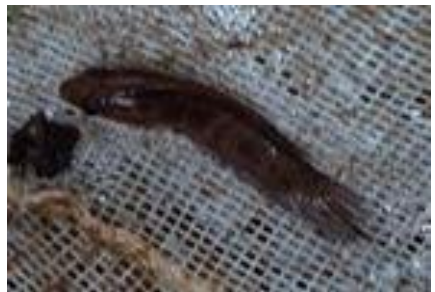
Juvenile Betta ibanorum .