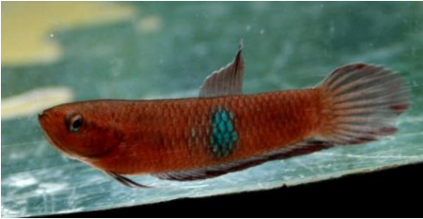
A male Betta brownorum Sibü