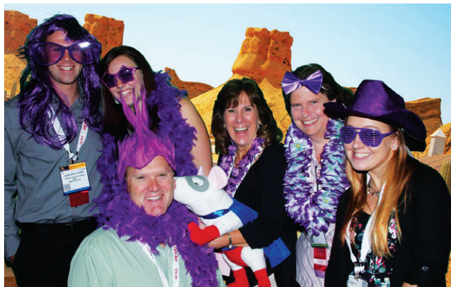
2015 AALAS National Meeting - Phoenix, AZ

The AALAS Foundation Encourages You to Celebrate the Mouse!