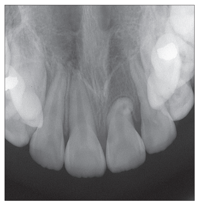
Figure 8. Post-treatment maxillary anterior occlusal radiograph reveals aligned but dilacerated left central incisor.