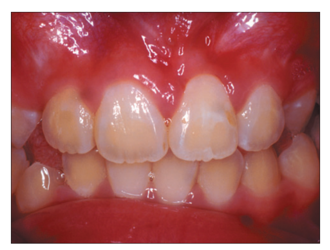
Figure 7. Frontal view at the completion of this phase of treatment.

tooth, 10,11 but these are limited to case reports. The surgical exposure and subsequent orthodontic traction of impacted dilacerated anterior teeth is another treatment option that would yield satisfactory results with proper case selection and carefully planned procedures.