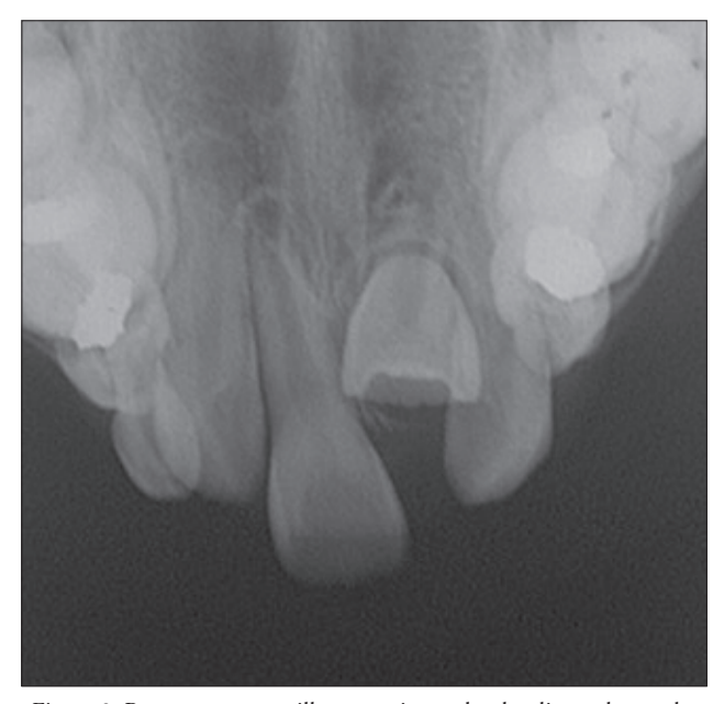
Figure 3. Pretreatment maxillary anterior occlusal radiograph reveals impacted left maxillary incisor.