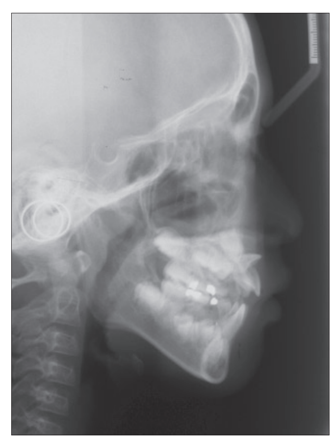
Figure 2. Pretreatment cephalometric radiograph discloses dilacerated maxillary incisor.

The treatment options were explained to the parents, and it was decided to attempt to bring the tooth into alignment after dental caries management. The patient was referred to the general dentist for carious deciduous teeth restoration. A fixed appliance was subsequently placed on the upper arch by the orthodontist to create adequate space for the impacted central incisor. Bands were placed on the upper first molars, and orthodontic brackets were limited to the 3 permanent anterior teeth (Figure 4).