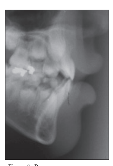
Figure 9. Post-treatment cephalometric radiograph discloses mildly dilacerated maxillary incisor.

approach. In this case study, the surgical intervention was performed, as the affected tooth has been asymptomatic and vital during the follow-up. The root apex, however, was mildly palpable in the labial sulcus. Longterm follow-up necessary to monitor the affected tooth and evaluate the necessity for root amputation and endodontic treatment.