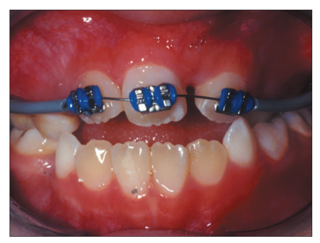
Figure 4. Frontal view showing fixed appliances on the maxillary arch.