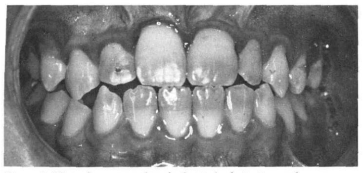
Figure 5. Note the narrow band of attached gingiva and marginal gingivitis along with the full eruption of both central incisors after 18 months.

was recommended. After four months, the oral hygiene had improved greatly and the left central incisor was fully visible (Figure 3). However, the right central incisor was still covered with nonkeratinized mucosa which was associated with the maxillary frenum; the crown of the tooth was uncovered surgically. A split thickness flap operation was performed labially and the residual adherent tissue covering the anatomical crown was removed. The flap was sutured apically. A gingivectomy was performed to expose the palatal surface of the tooth. A noneugenol periodontal pack was placed for one week. On removal, the area appeared to be healing normally. Soft tissue was gently debrided with 3% hydrogen peroxide solution, and the necessity for improved oral hygiene was emphasized (Figure 4). Two weeks postoperatively healing was normal and oral hygiene had improved greatly. Eruption of the teeth was observed for 12 months.