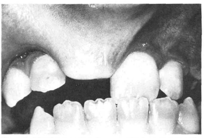
Figure 3. After four months of conservative treatment since the initial visit, the left central incisor erupted into crossbite.

The child was instructed to occlude purposely on the soft tissue covering the incisal edges of the incisors. In addition, a snack regimen consisting of raw vegetables