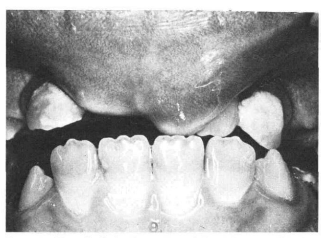
Figure 1. Note the lack of eruption of the right central incisor and partial emergence of the left central incisor. Note also the lack of fornix and the plaque accumulation on the labial surfaces of the maxillary lateral incisors.

{f A} ten-year-old male presented with the complaint that both permanent maxillary central incisors had failed to erupt. The right central incisor crown was covered completely by an adherent elastic mucosa, and the left central incisor crown was exposed only at the distoincisal edge. The anatomical crowns of the teeth could be palpated (Figure 1). There was lack of attached gingiva adjacent to the maxillary central incisors with an absence of the anterior vestibular fornix. Oral hygiene was poor and severe gingival inflammation was present in the vestibular area adjacent to the lateral incisors. Inflammation of gingival tissue was most evident mesial to the maxillary lateral incisors where tissue folds entrapped plaque and food debris. The maxillary right lateral incisor showed an area of hypocalcification on the labial surface with subsequent demineralization due to inadequate plague removal. A band of intrinsic strain of unknown etiology was evident on the incisal half of the four mandibular permanent incisors.