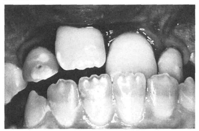
Figure 4. One week postoperatively, the surgical area shows adequate healing. Note the poor oral hygiene in the mandibular incisor area.

region of the mouth at age eight in a bicycle accident, causing severe laceration of soft tissue and intrusion of both erupting permanent central incisors. The oral wound was not treated and healing may have occurred by fusion of labial and palatal fibrous connective tissue and oral epithelium. This accident may have resulted in loss of attached gingiva and delayed eruption of the permanent central incisors. The amount of gingiva may have been minimal or not present prior to the trauma and severe laceration of the labial frenum may have occurred with simultaneous intrusive luxation of the teeth resulting in the fusion of labial and palatal soft tissues.