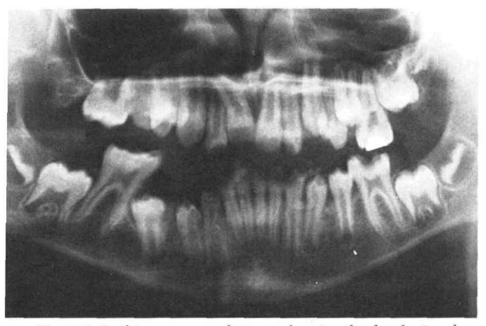
Figure 2. In this panorex radiogram showing the developing dentition, note the root dilaceration of the maxillary right central incisor. Mesial migration of the maxillary left first permanent molar is considered to be a result of premature loss of second primary molar.