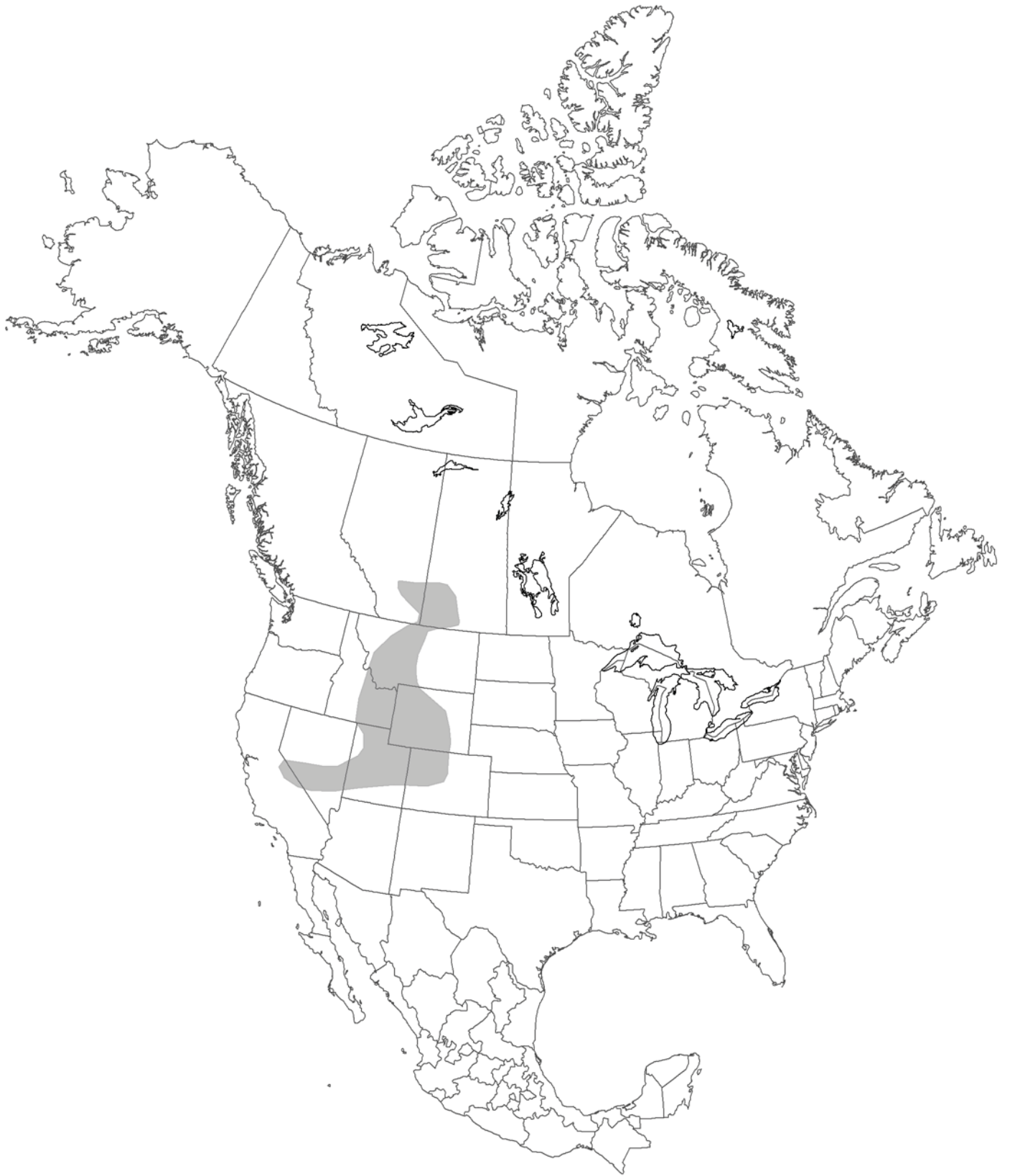
Figure 2: Distribution of slender mouse-ear-crec in North America (based on information available from NatureServe 2009).